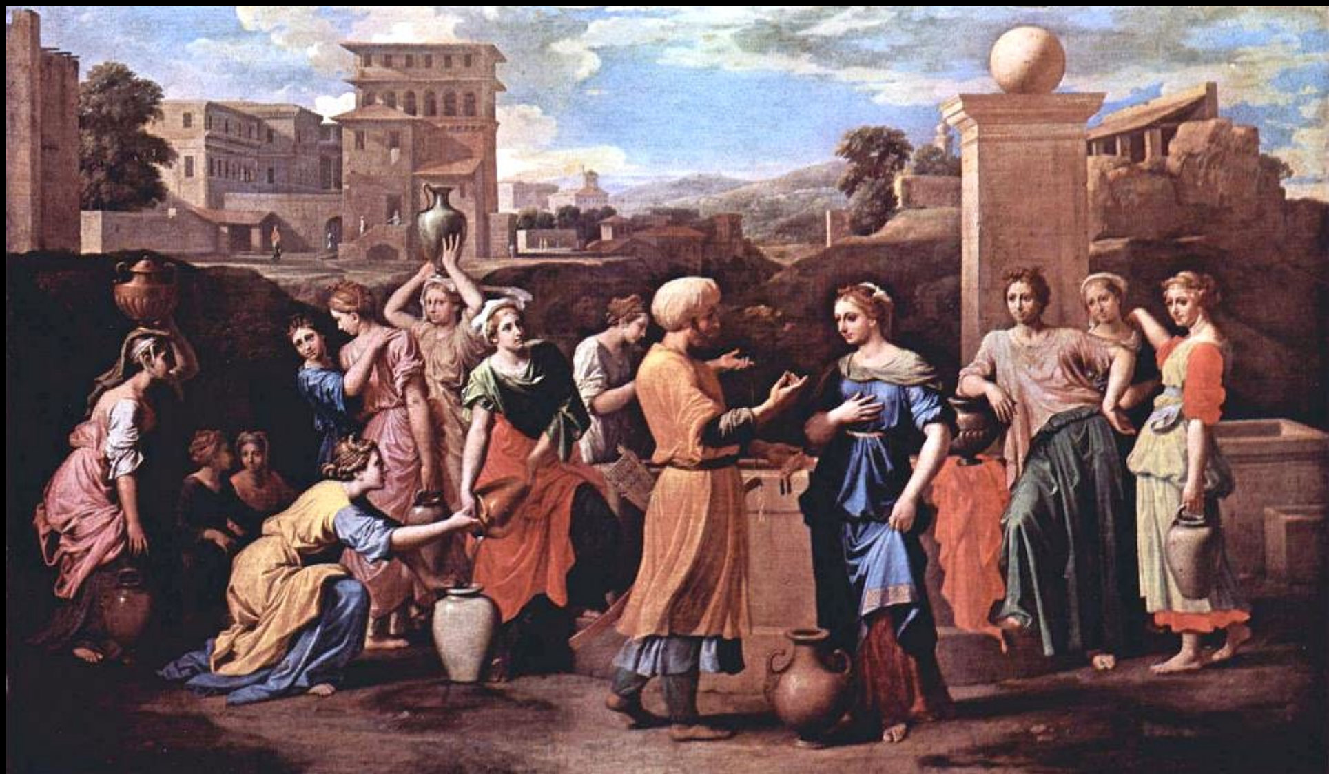
Rebecca at the Well -- Nicolas Poussin, Louvre Museum, Paris, France