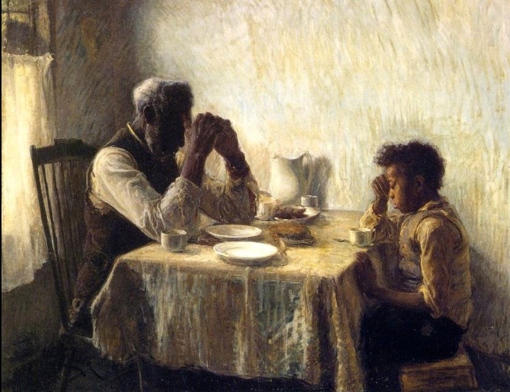
The Thankful Poor -- Henry Ossawa Tanner