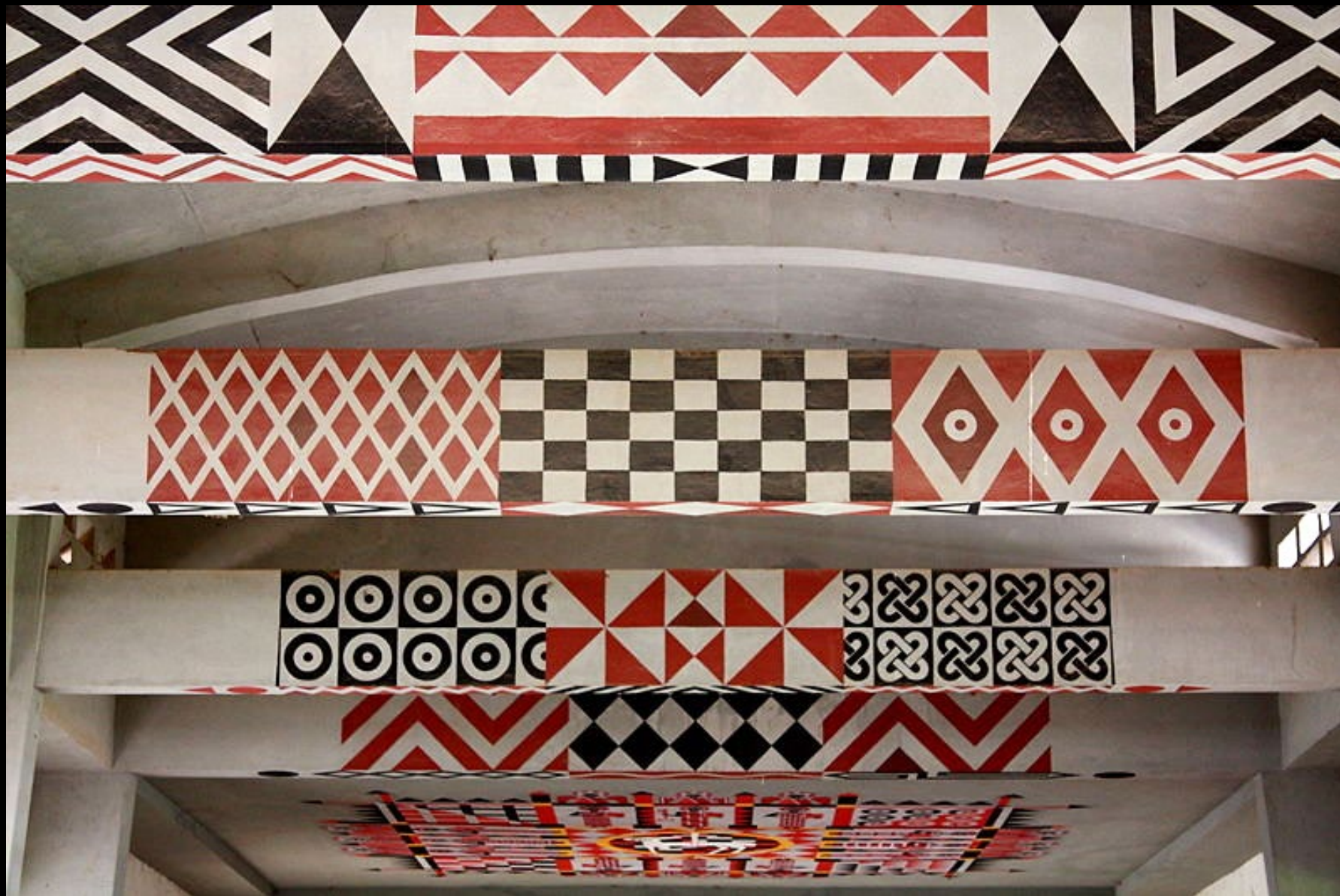
Ceiling of Keur Moussa Abbey, Senegal