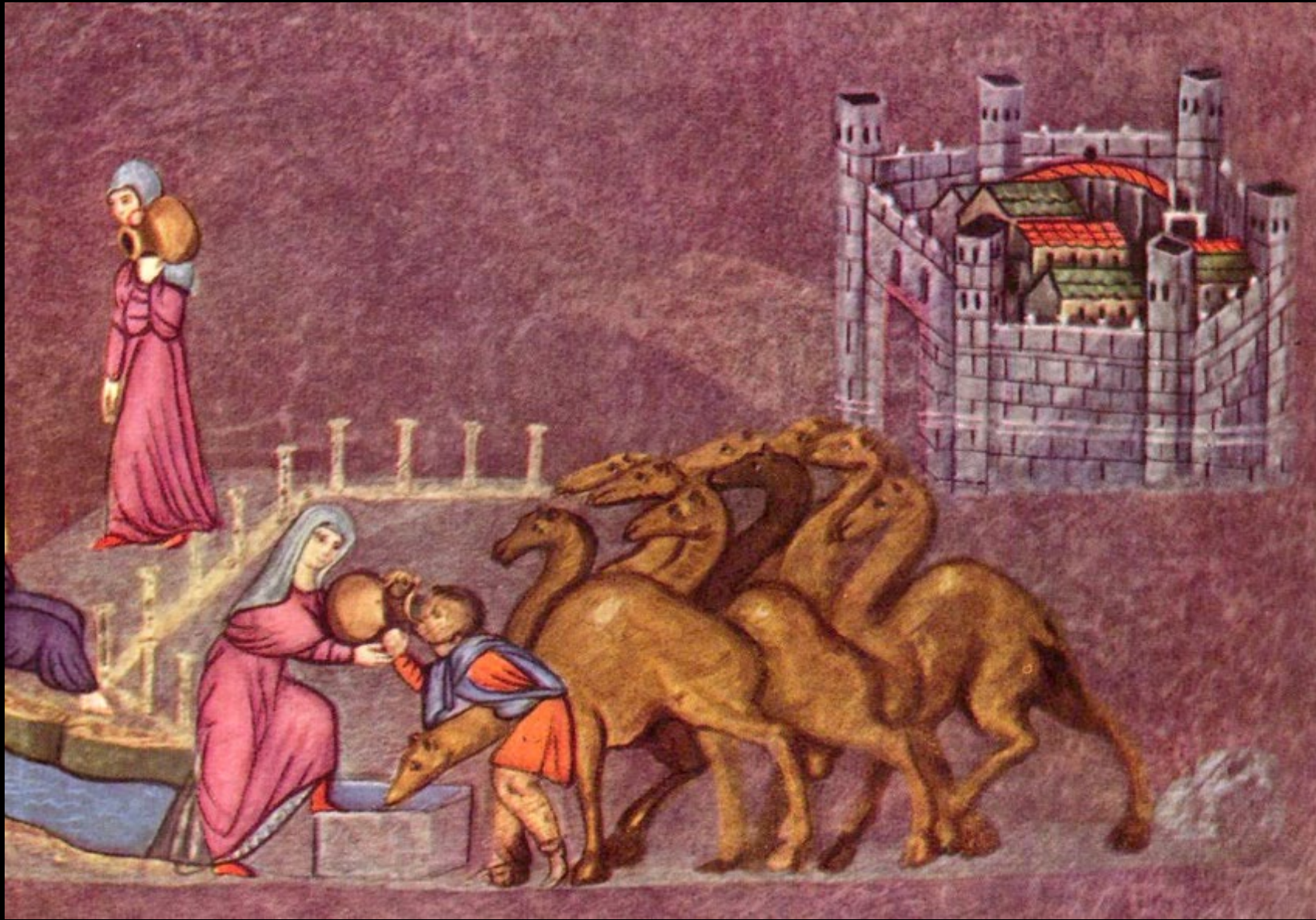
Rebecca at the Well -- Österreichische Nationalbibliothek, Vienna, Austria