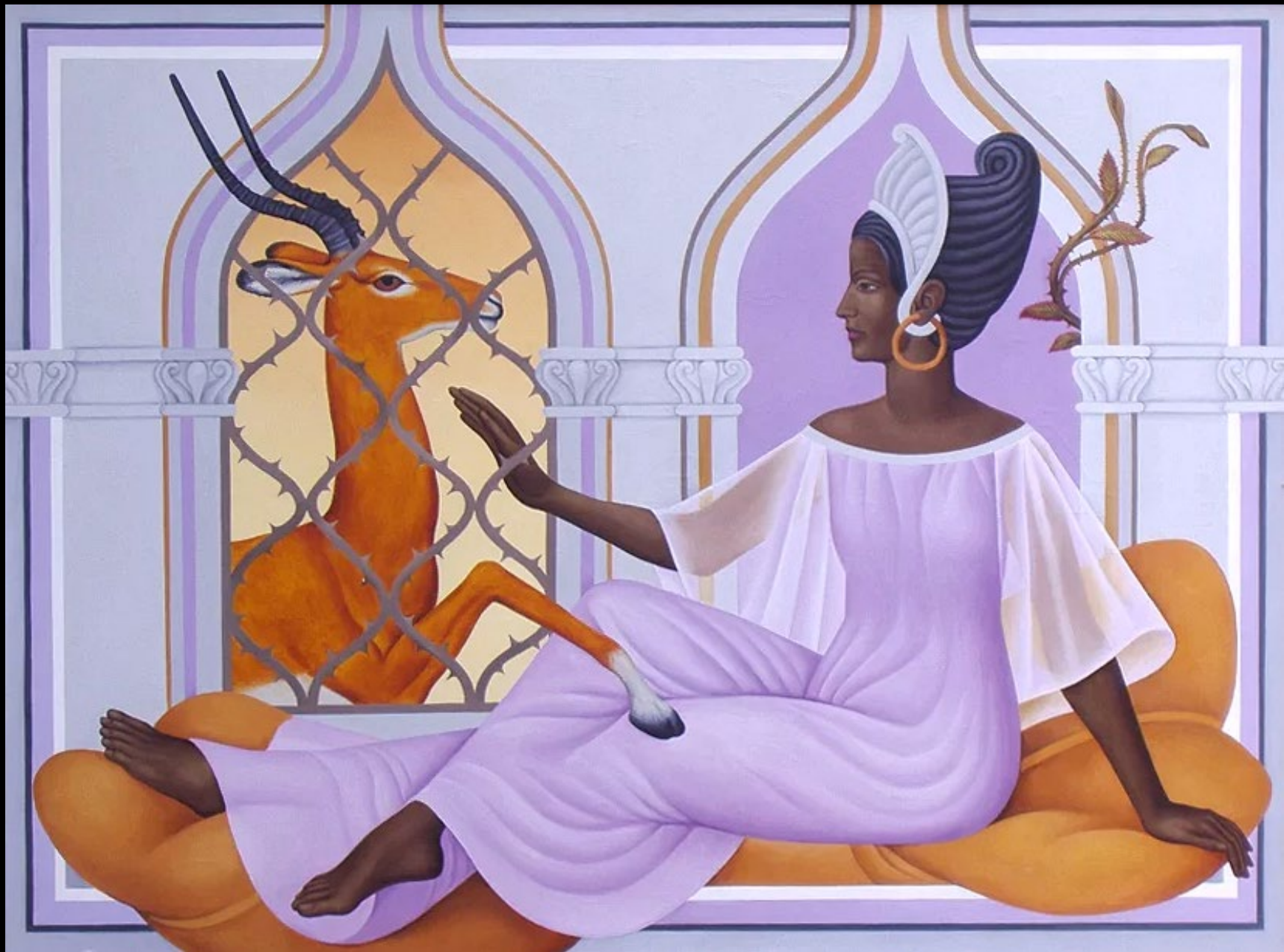
Lattice Window – Song of Solomon -- Peter Koenig