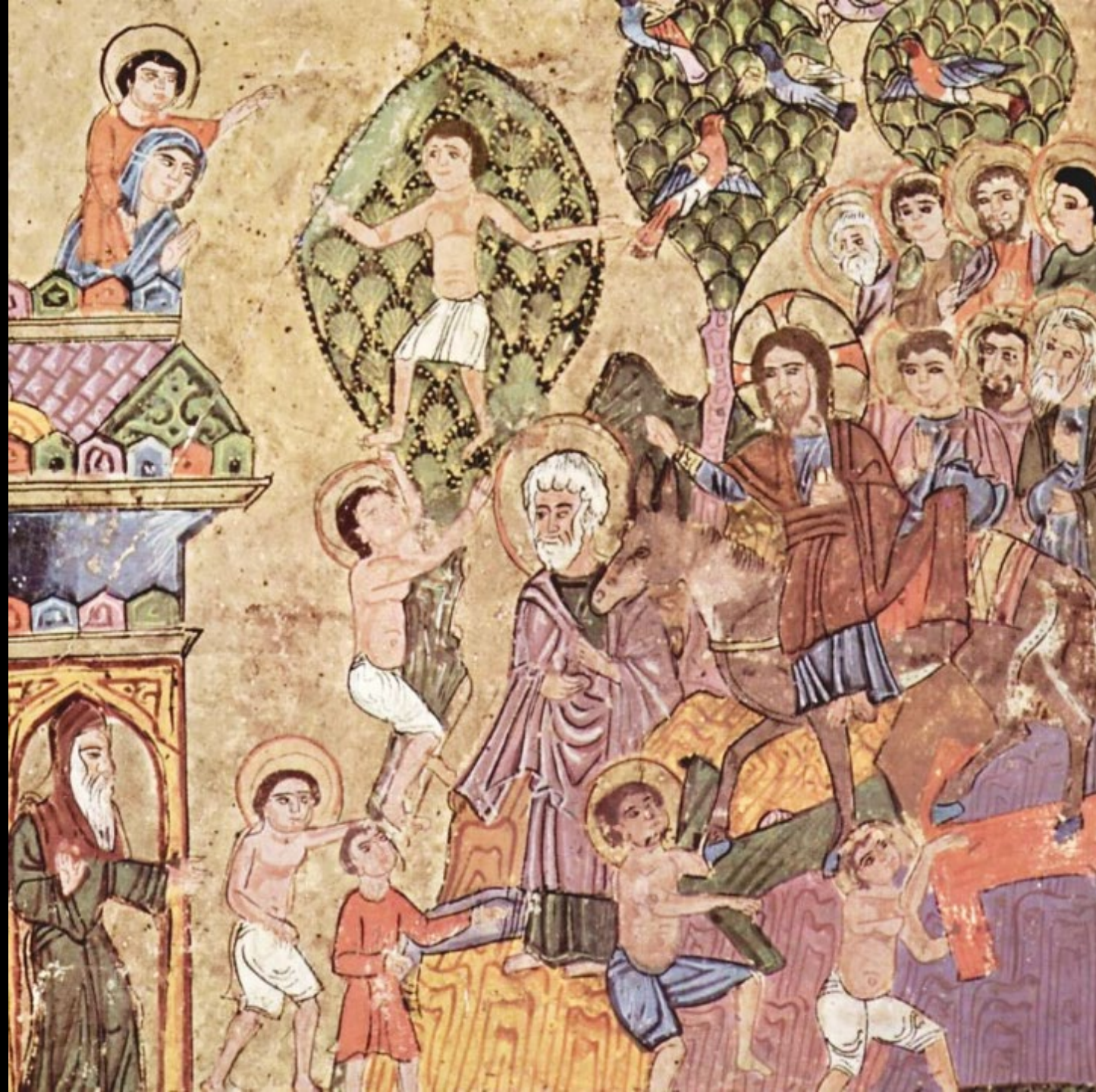
Christ Enters Jerusalem Syrian Jacobite Church Vatican Museum Vatican City