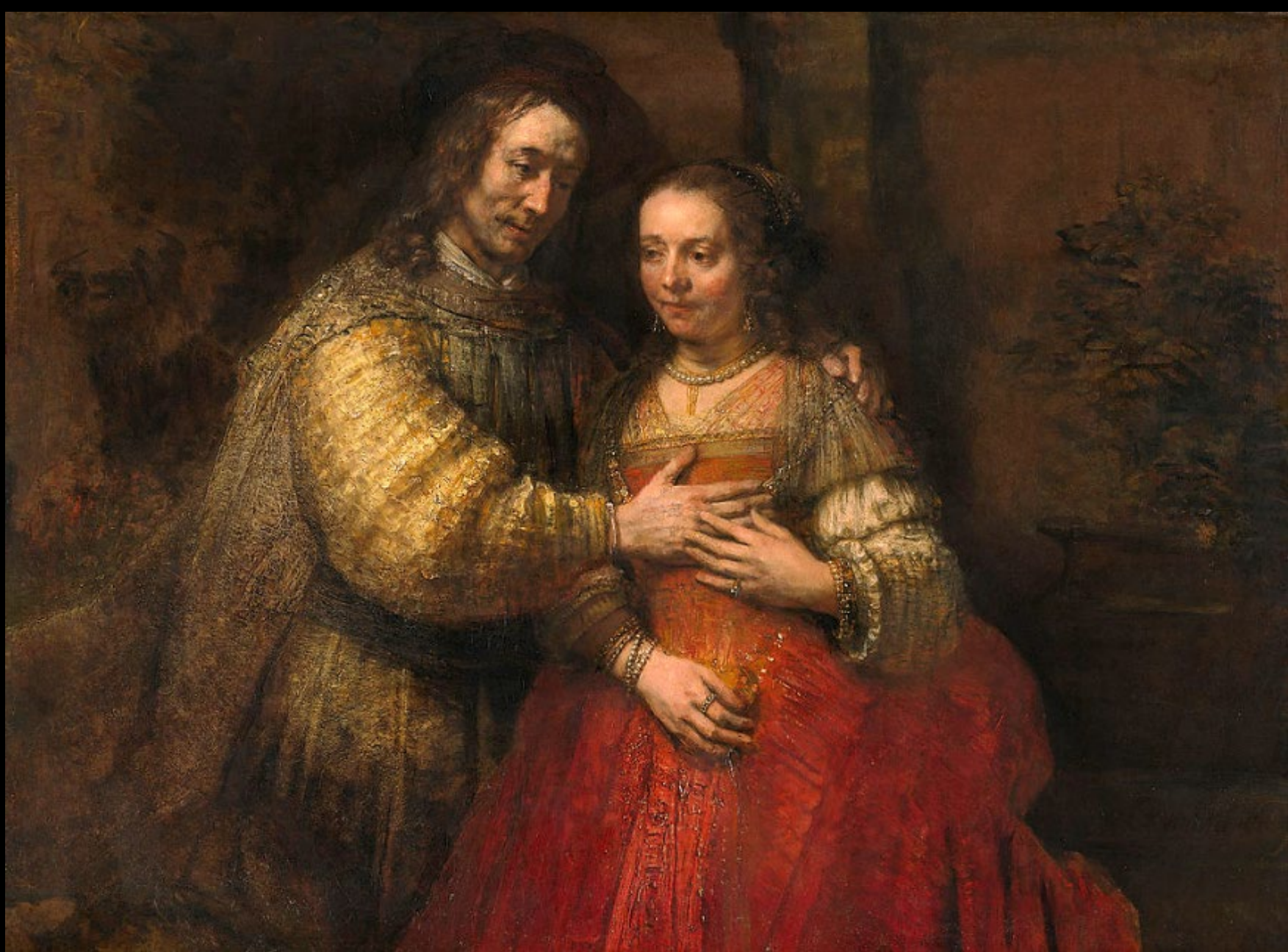
Isaac and Rebecca -- Rembrandt, Rijksmuseum, Amsterdam, Netherlands