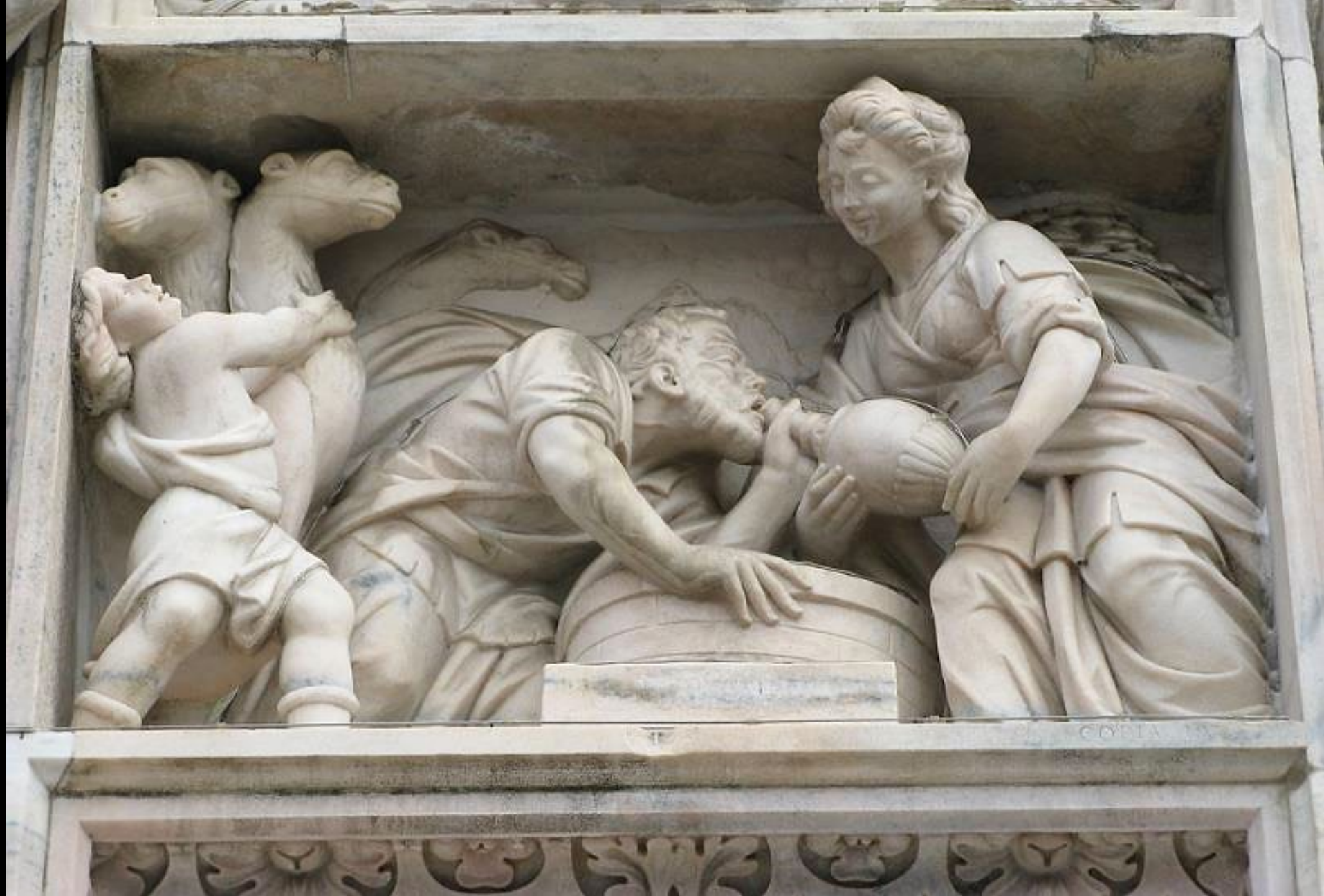
Isaac's Messenger Drinks from Rebecca's Jug -- Duomo, Milan, Italy