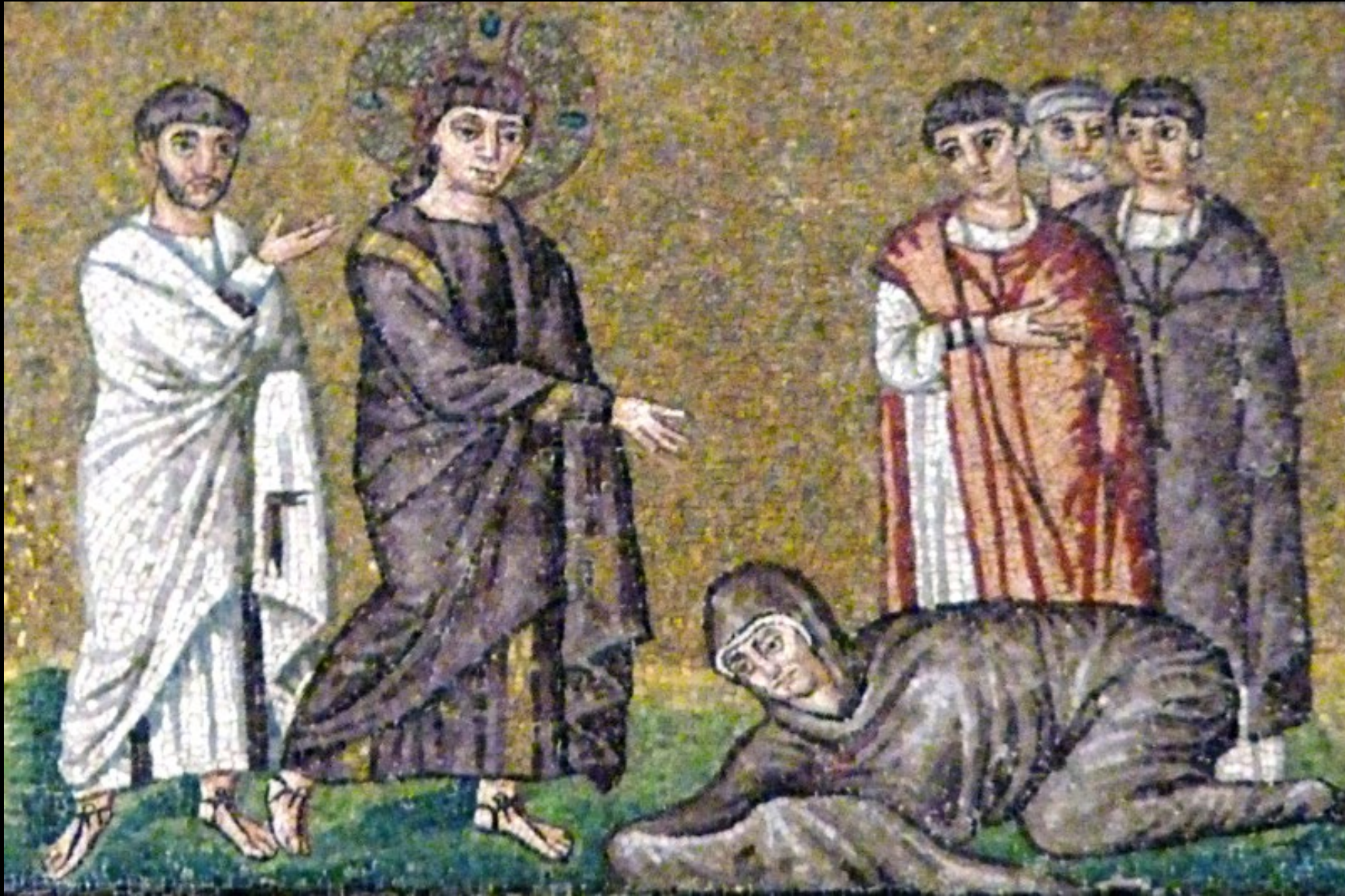
Christ Heals the Woman Who Touched His Cloak -- Sant'Apollinaire Nuovo, Ravenna, Italy