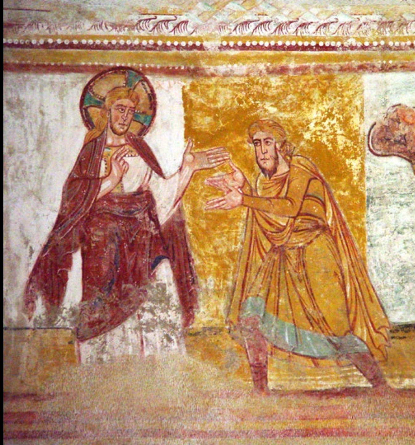
The Calling of Abraham