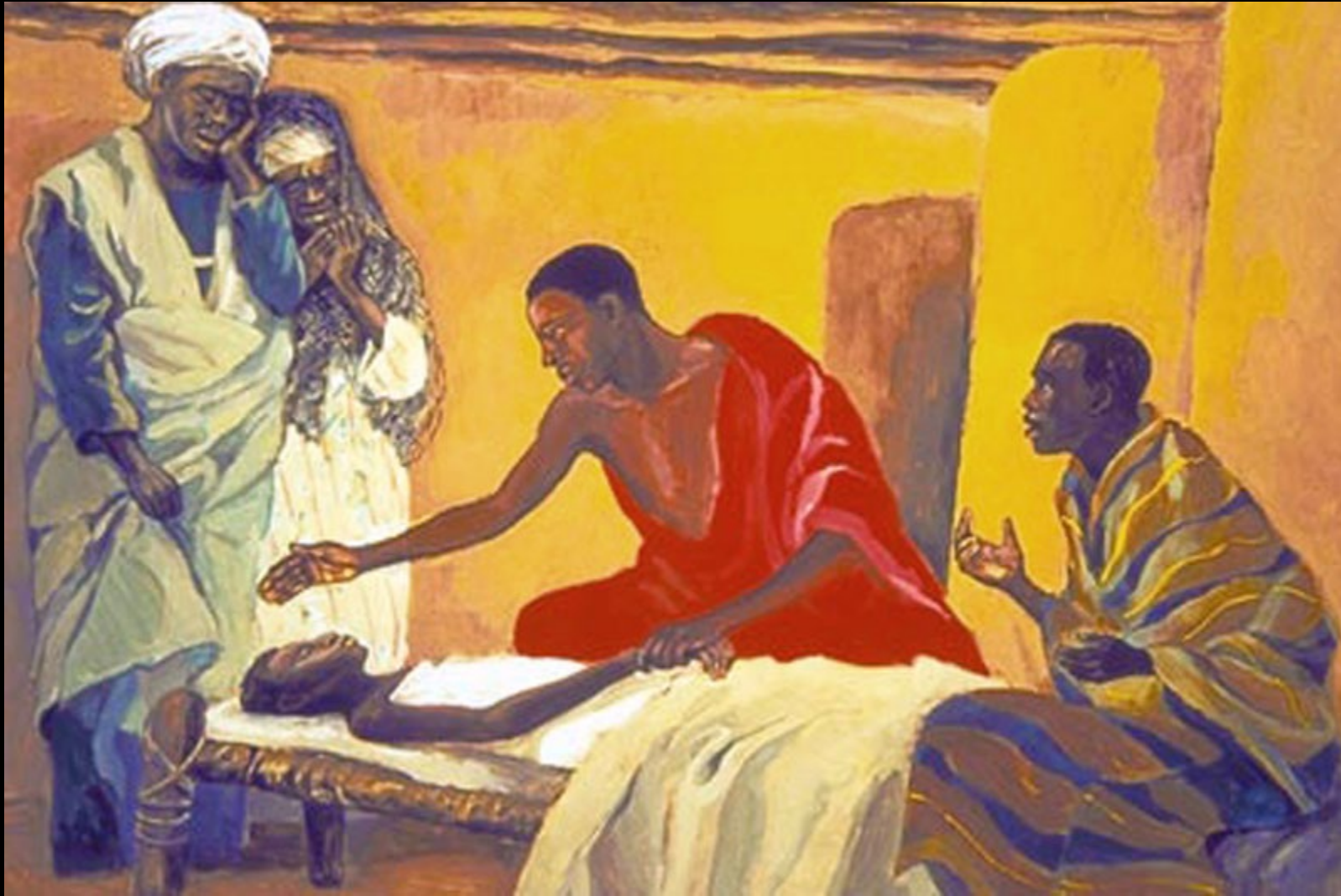
Jesus Raises the Child -- JESUS MAFA, Cameroon