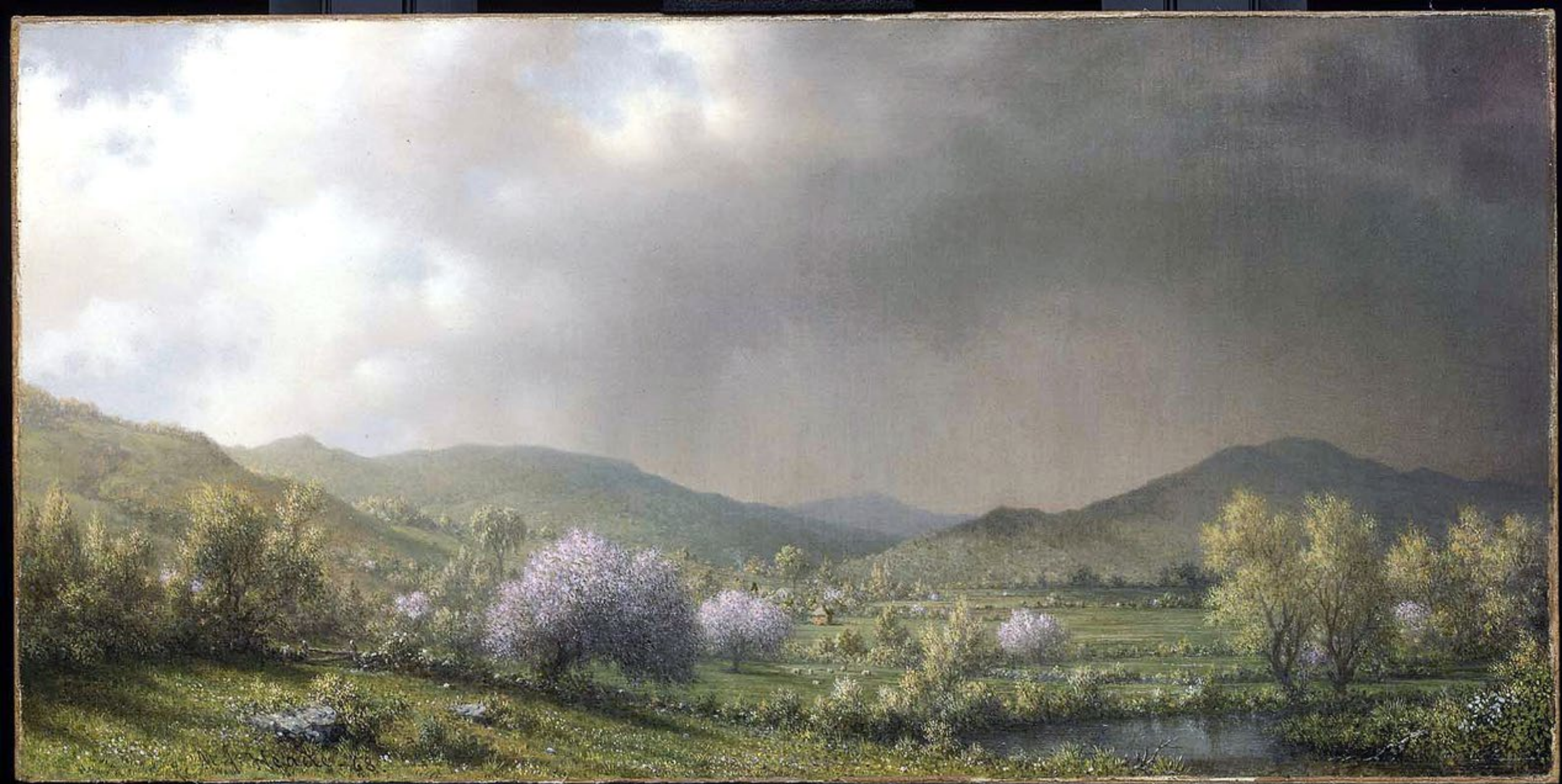
April Showers -- Martin Johnson Heade, Museum of Fine Arts, Boston, MA