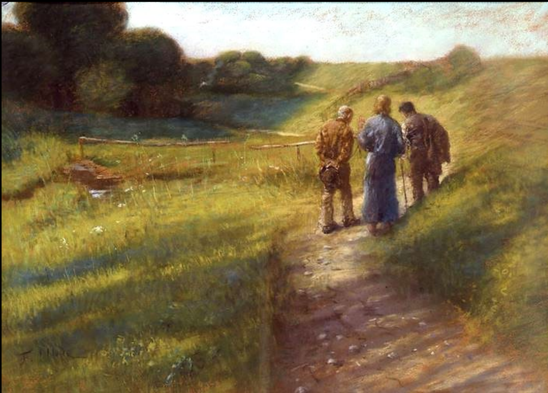
Road to Emmaus -- Fritz von Uhde, New Masters Gallery, Dresden, Germany