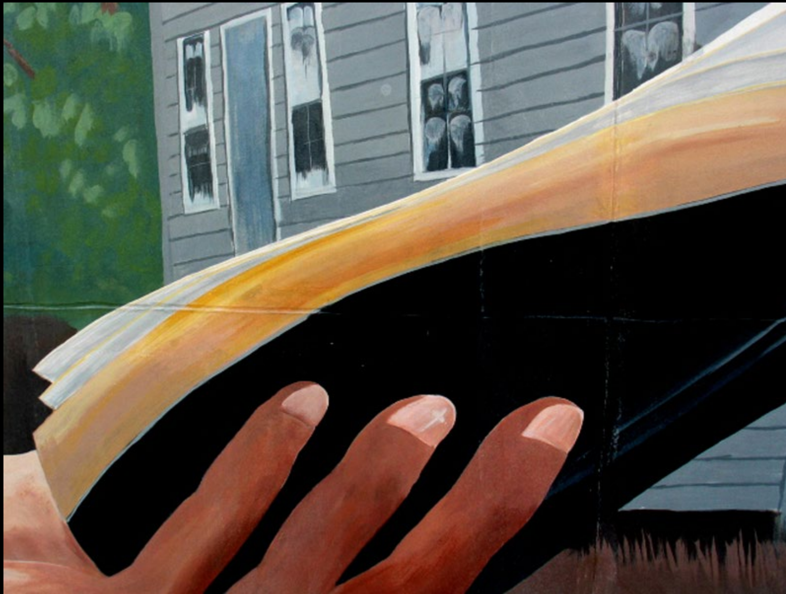
Billy Graham Preaching (detail) -- Palatka, FL