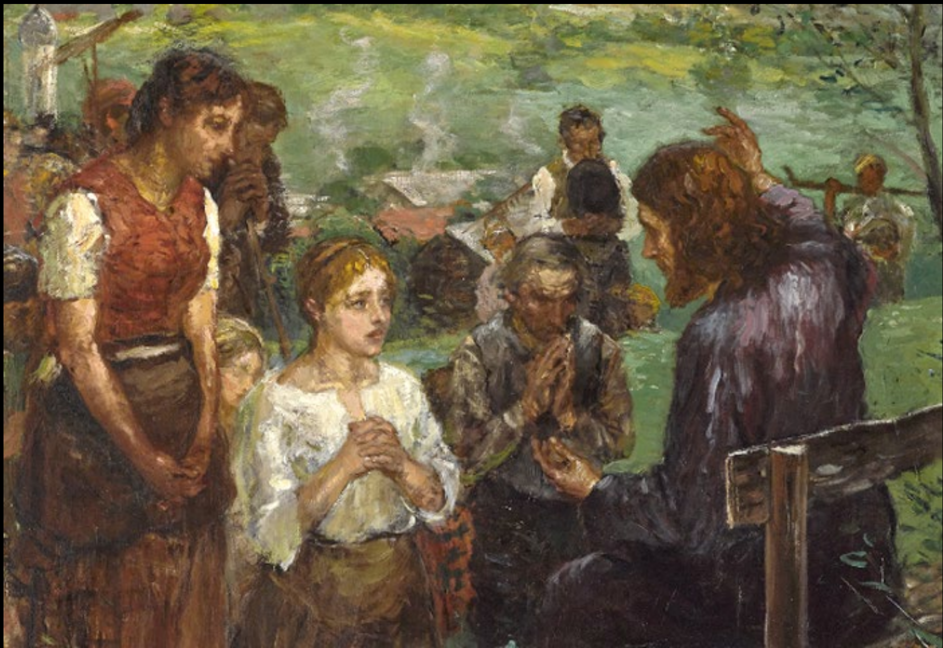
Christ Teaching -- Fritz von Uhde, Museum of Fine Arts, Budapest, Hungary