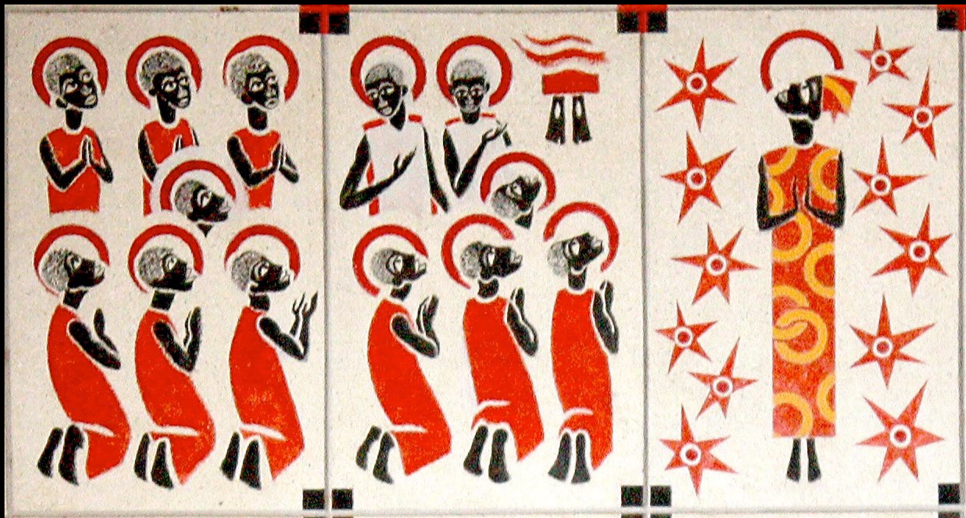
Ascension -- Keur Moussa Abbey, Keur Moussa, Senegal