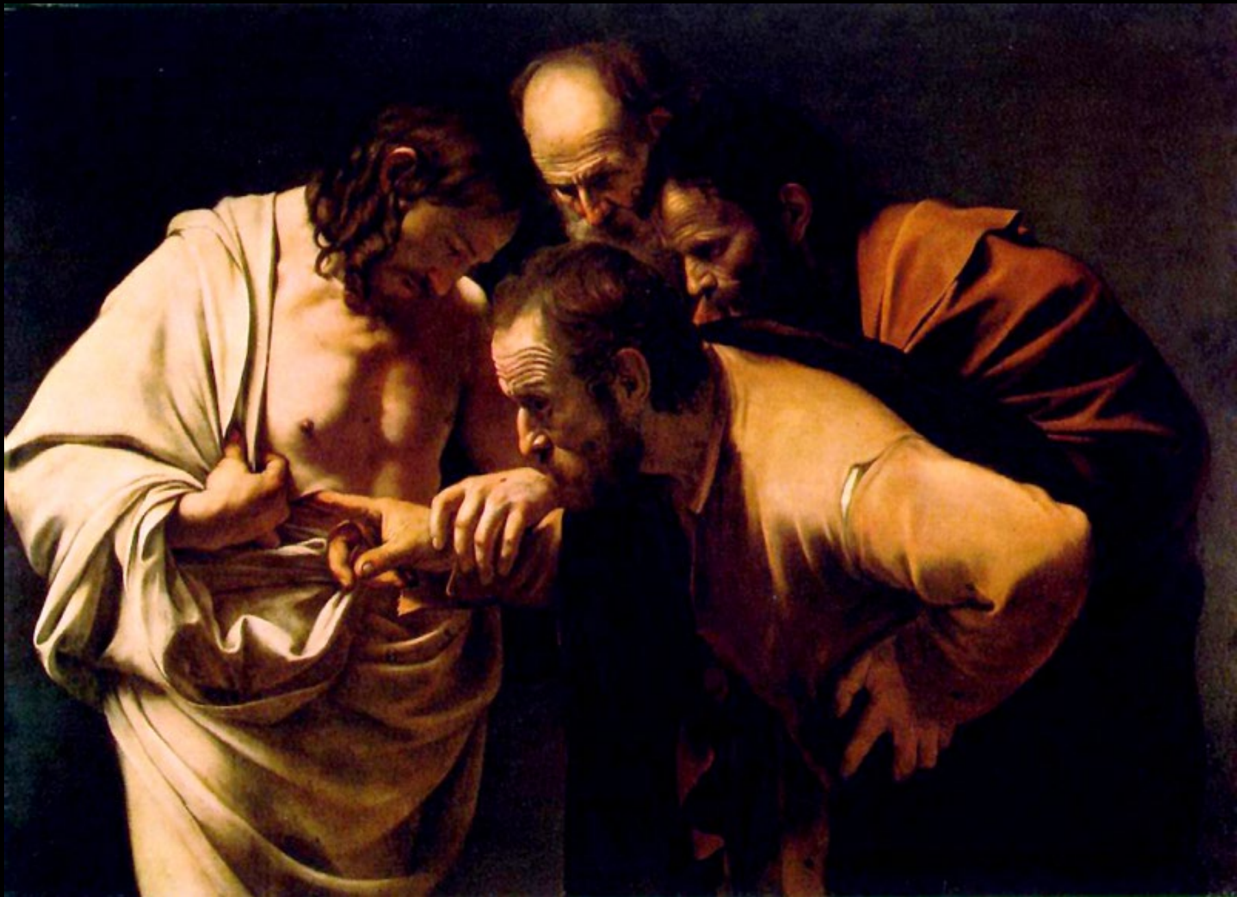
The Incredulity of Thomas -- Caravaggio, Sanssouci, Potsdam, Germany