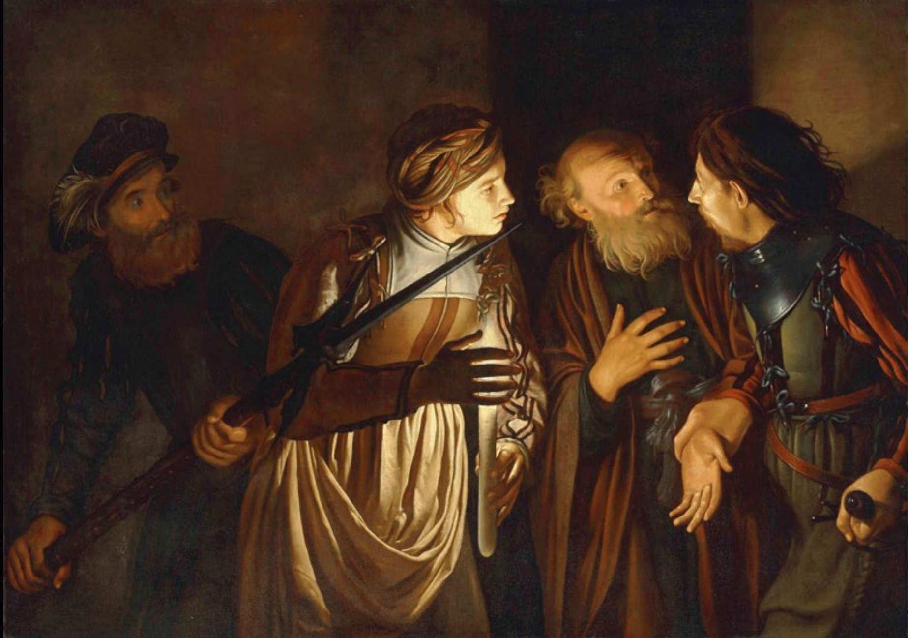
Peter's Denial -- Adam de Coster, early 17 th century