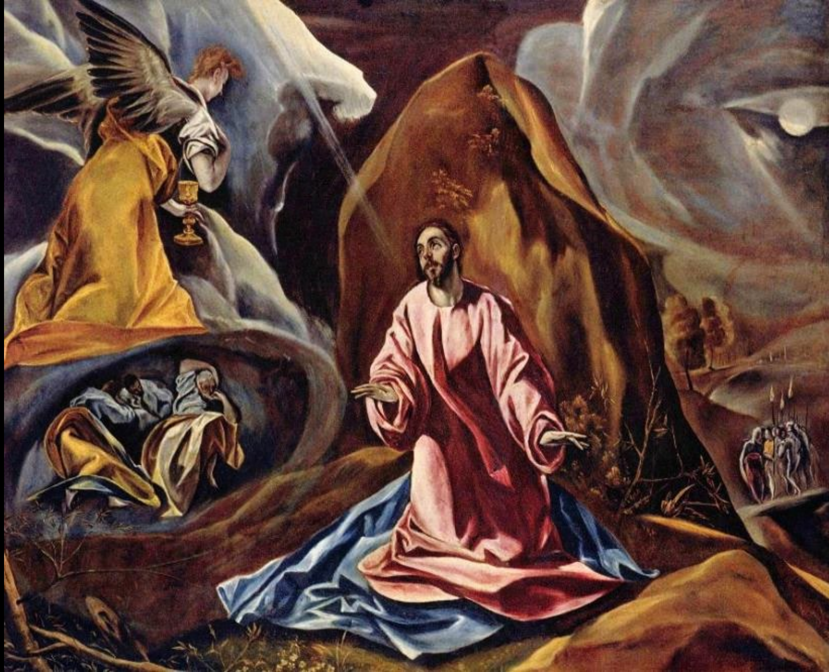
Christ on the Mount -- El Greco, National Gallery, London, England