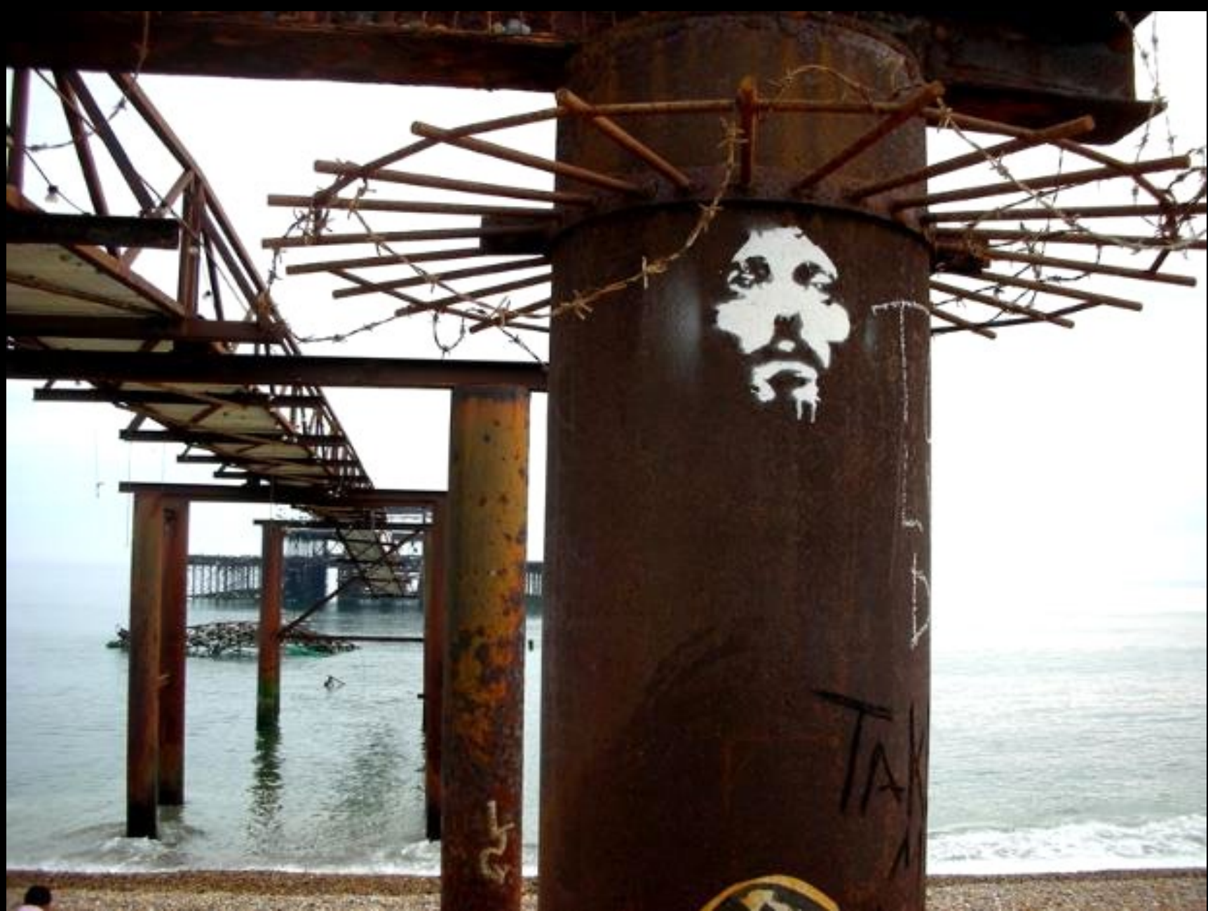
Crown of Thorns -- Easter 2007, West Pier, Brighton, England