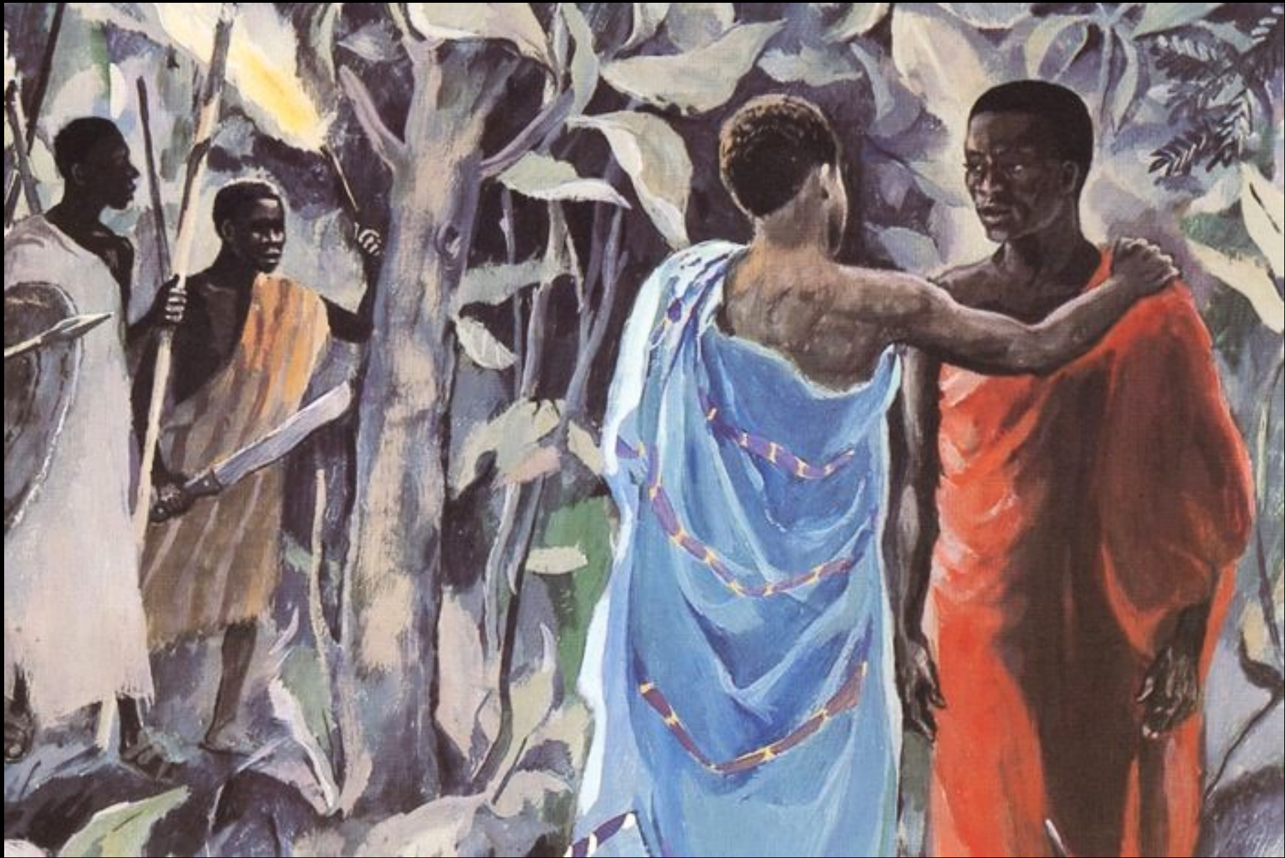
Kiss of Judas -- JESUS MAFA, Cameroon