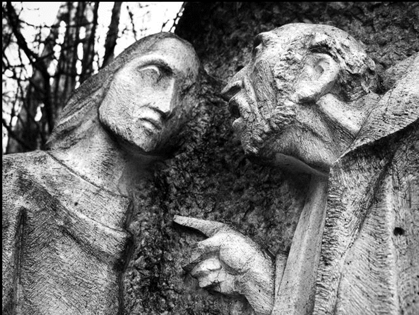
The Sanhedrin Examine Jesus -- Santuario di Lourdes Nevegal, Nevegal, Italy