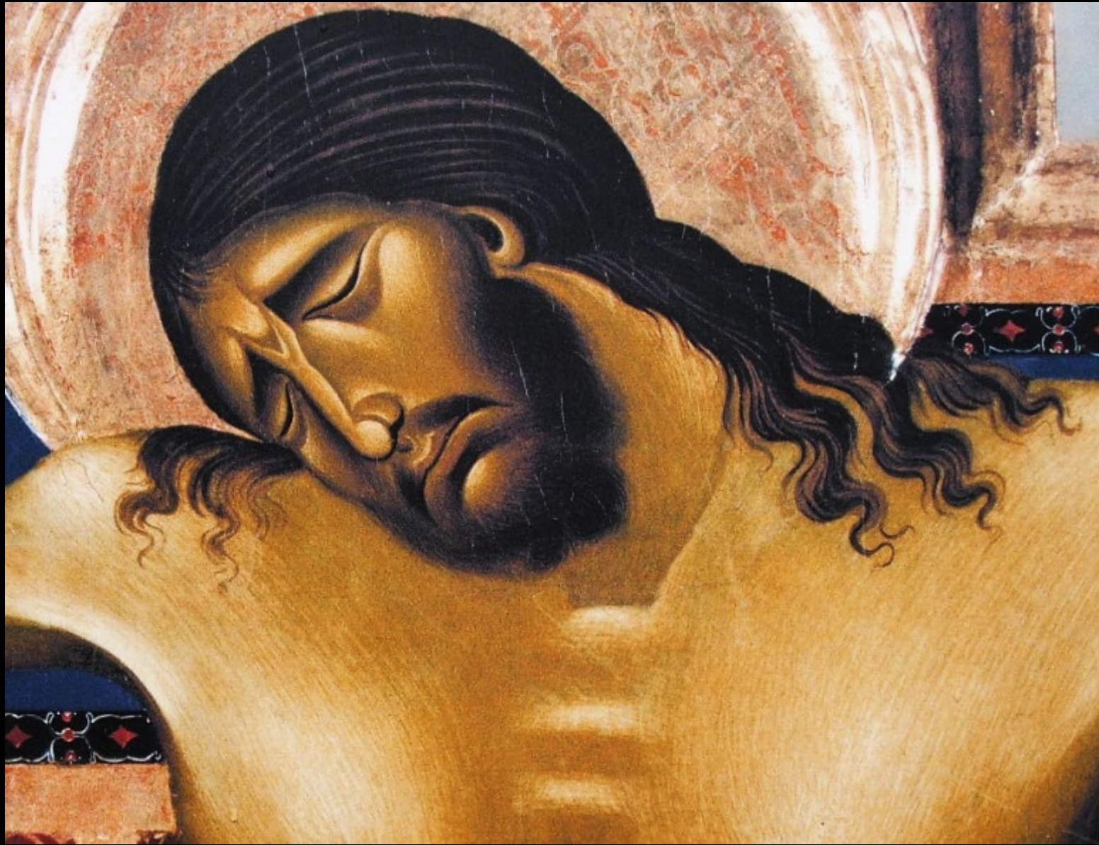
Crucifixion, detail -- Cimabue, Church of San Domenico, Arezzo, Italy