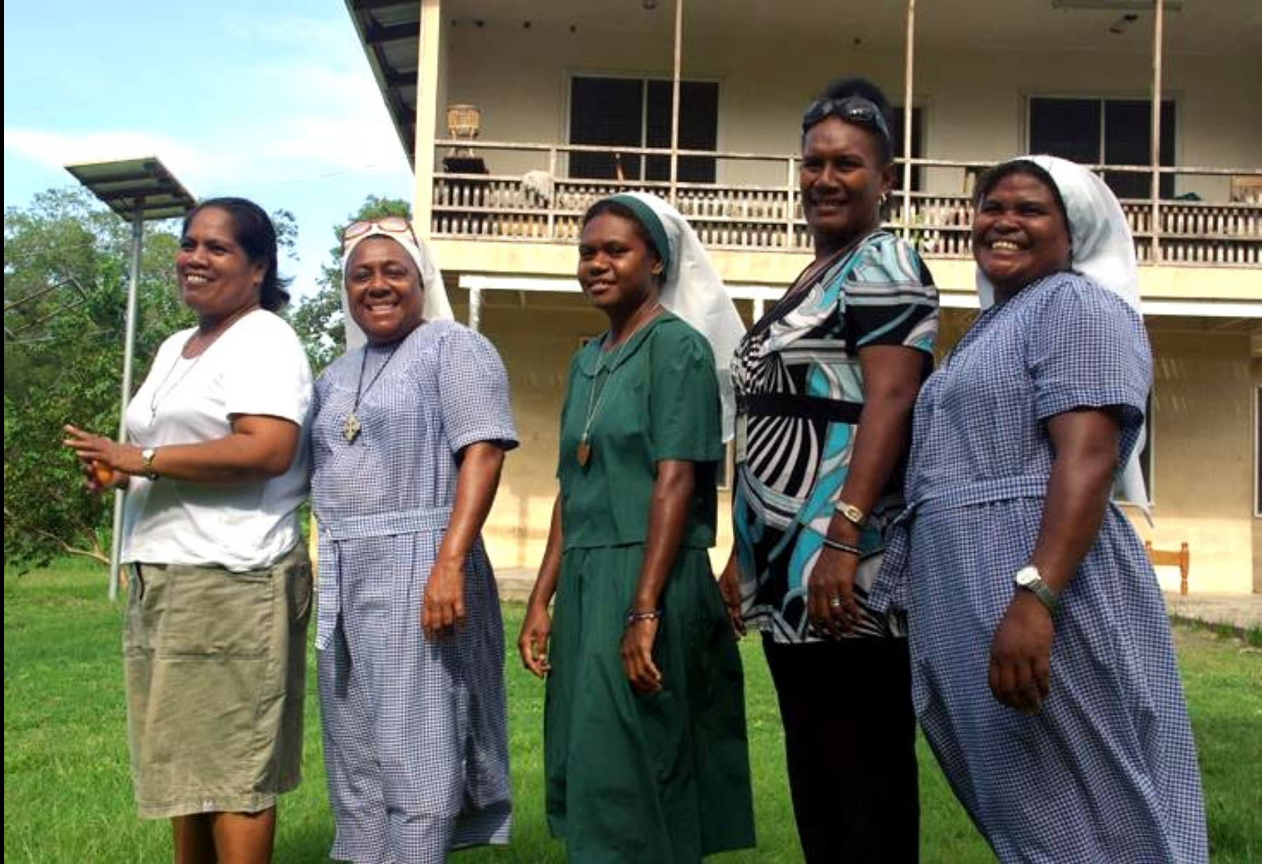
Nuns of the Christian Care Centre Community of Sisters of the Church, Honiara, Solomon Islands