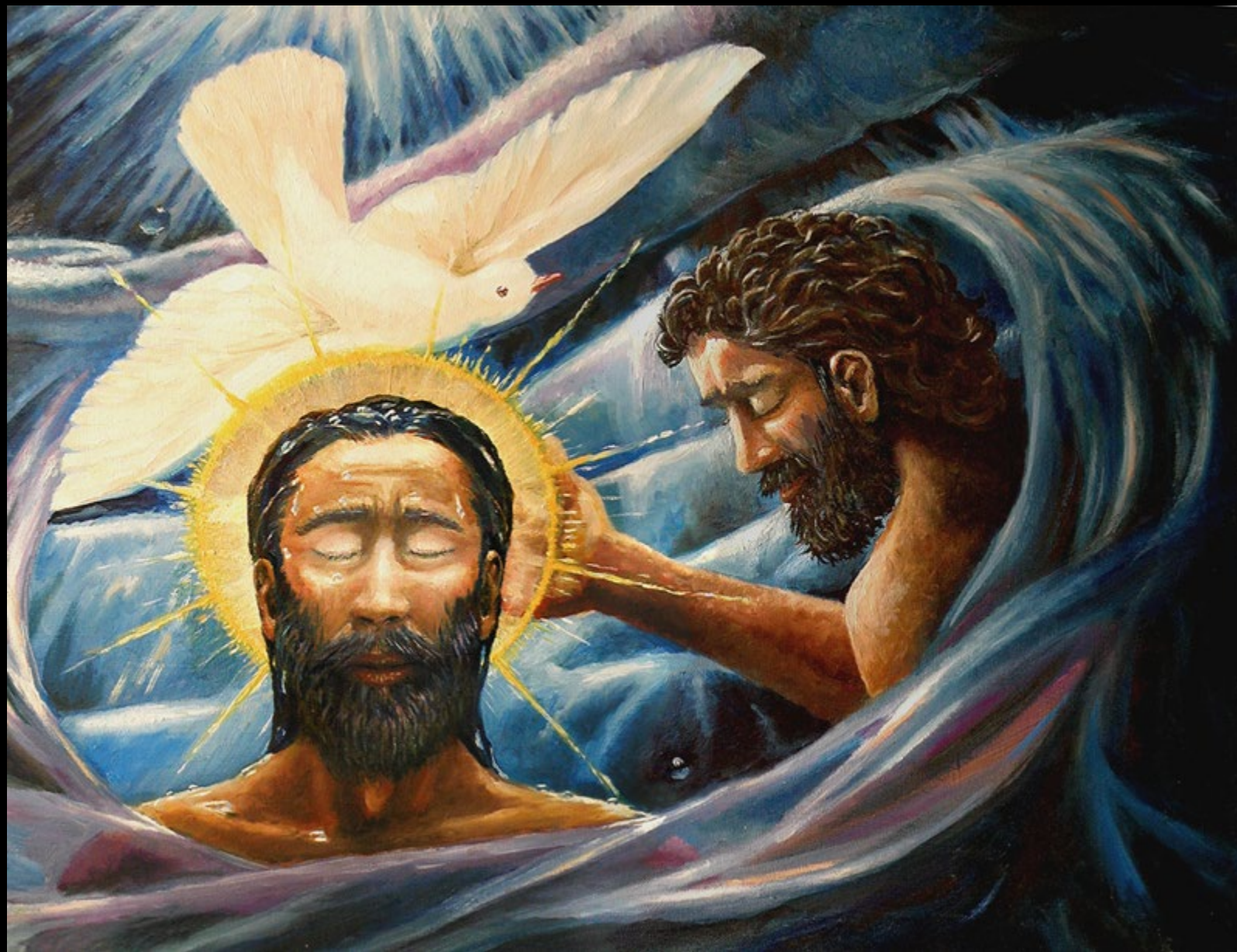
Baptism of Christ -- Dave Zelenka