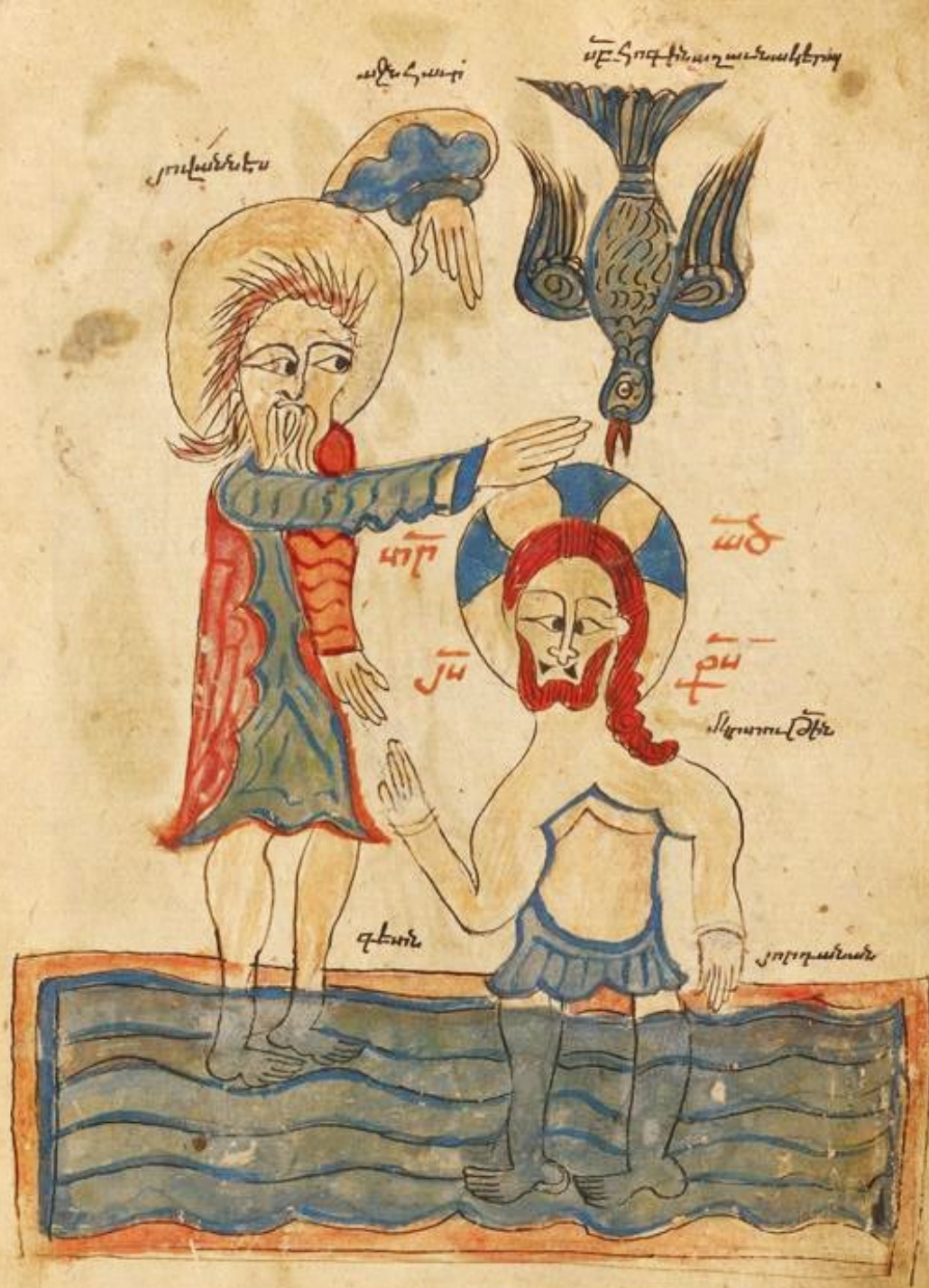
Baptism of Christ 14 th century Turkey J. Paul Getty Museum Los Angeles, CA