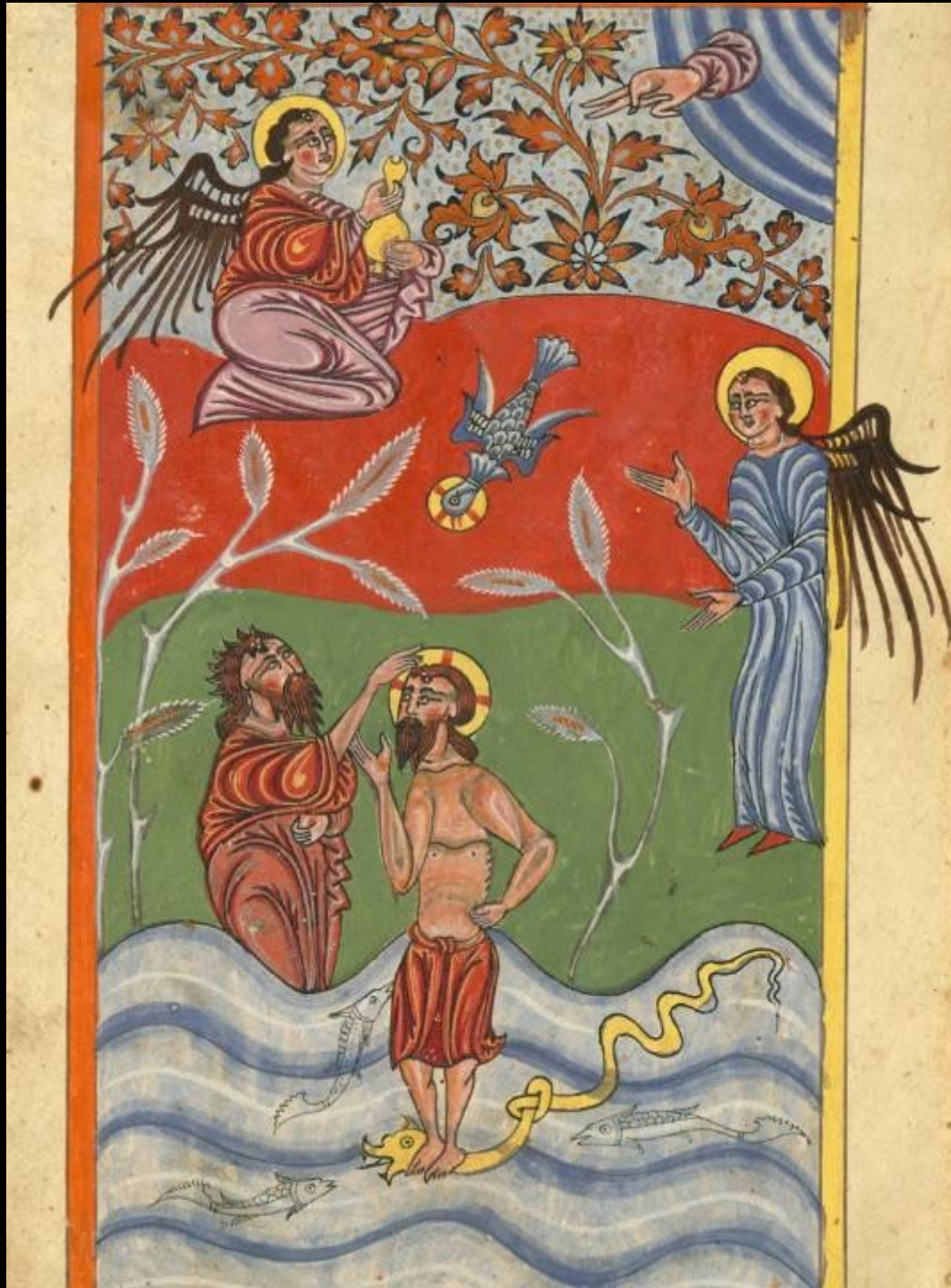
Baptism of Christ 15 th c. Armenian Walters Art Museum Baltimore, MD