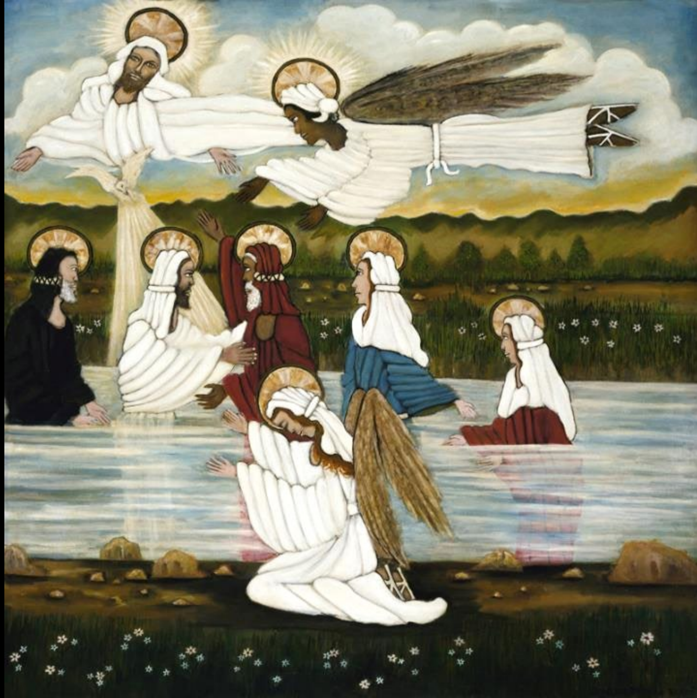
Baptism of Christ Lorenzo Scott Smithsonian American Art Museum Washington, DC