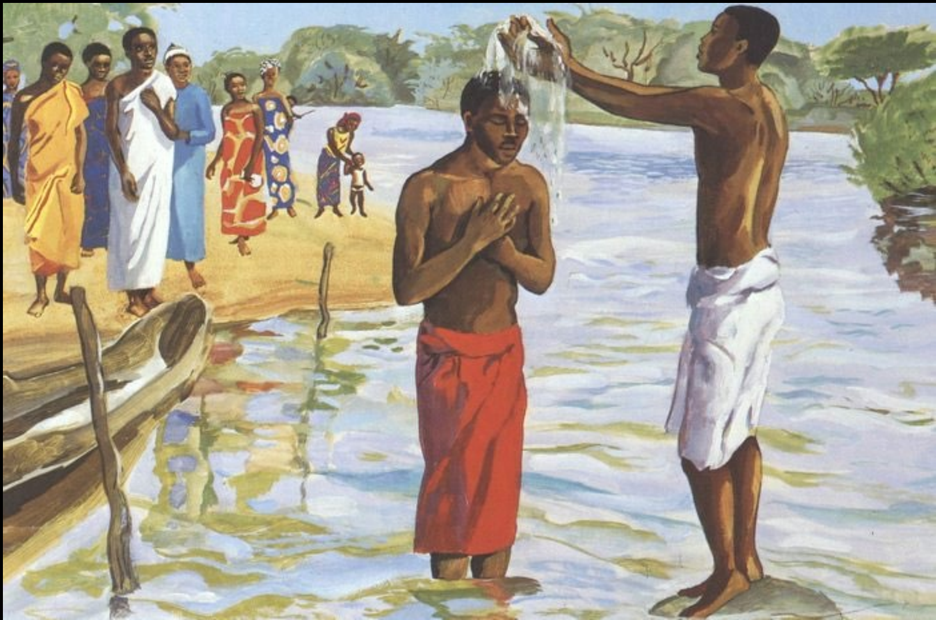
John Baptizes Jesus -- JESUS MAFA, Cameroon