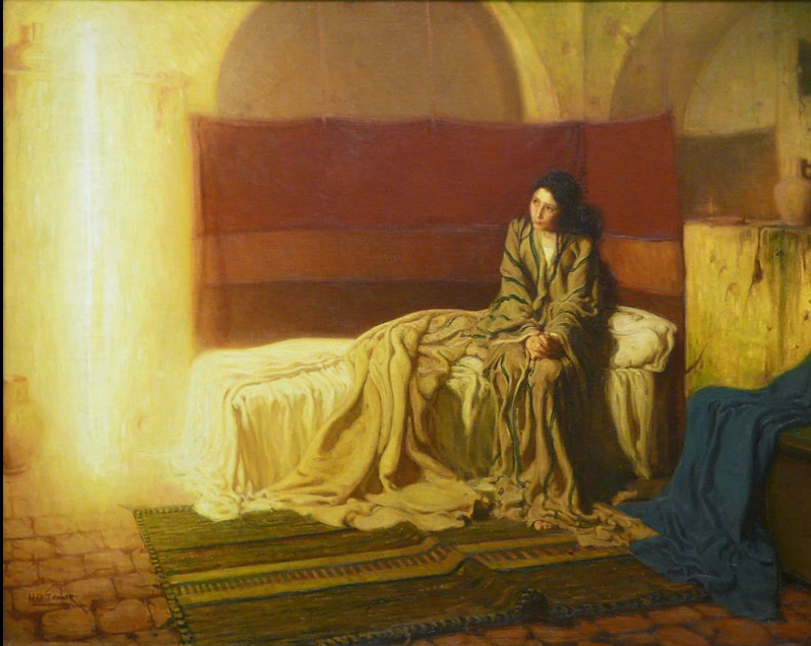
Annunciation -- Henry Ossawa Tanner, Philadelphia Museum of Art