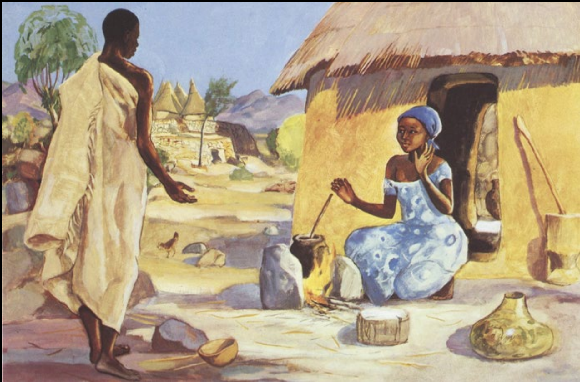
The Annunciation -- JESUS MAFA, Cameroon