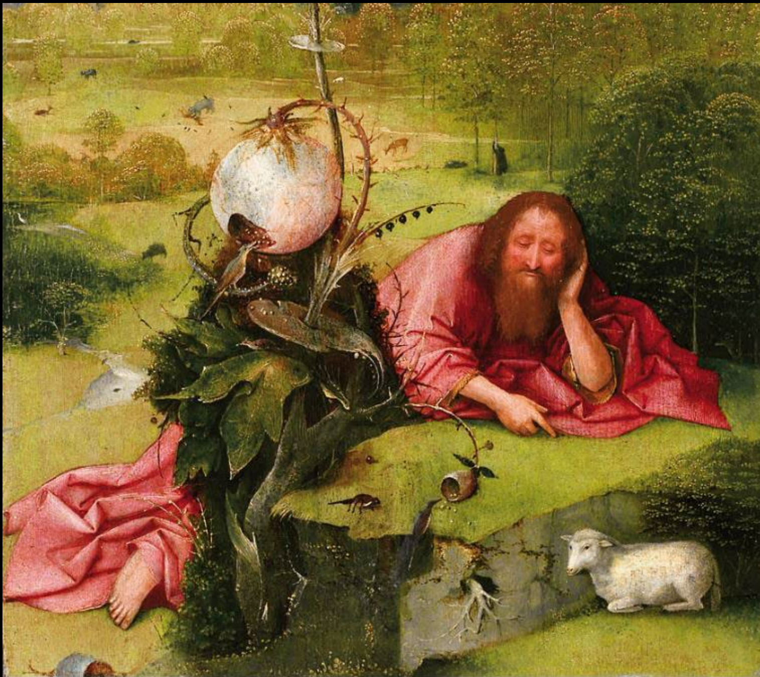
John the Baptist in the Wilderness

Hieronymus Bosch Museum of Lázaro Galdiano Madrid, Spain