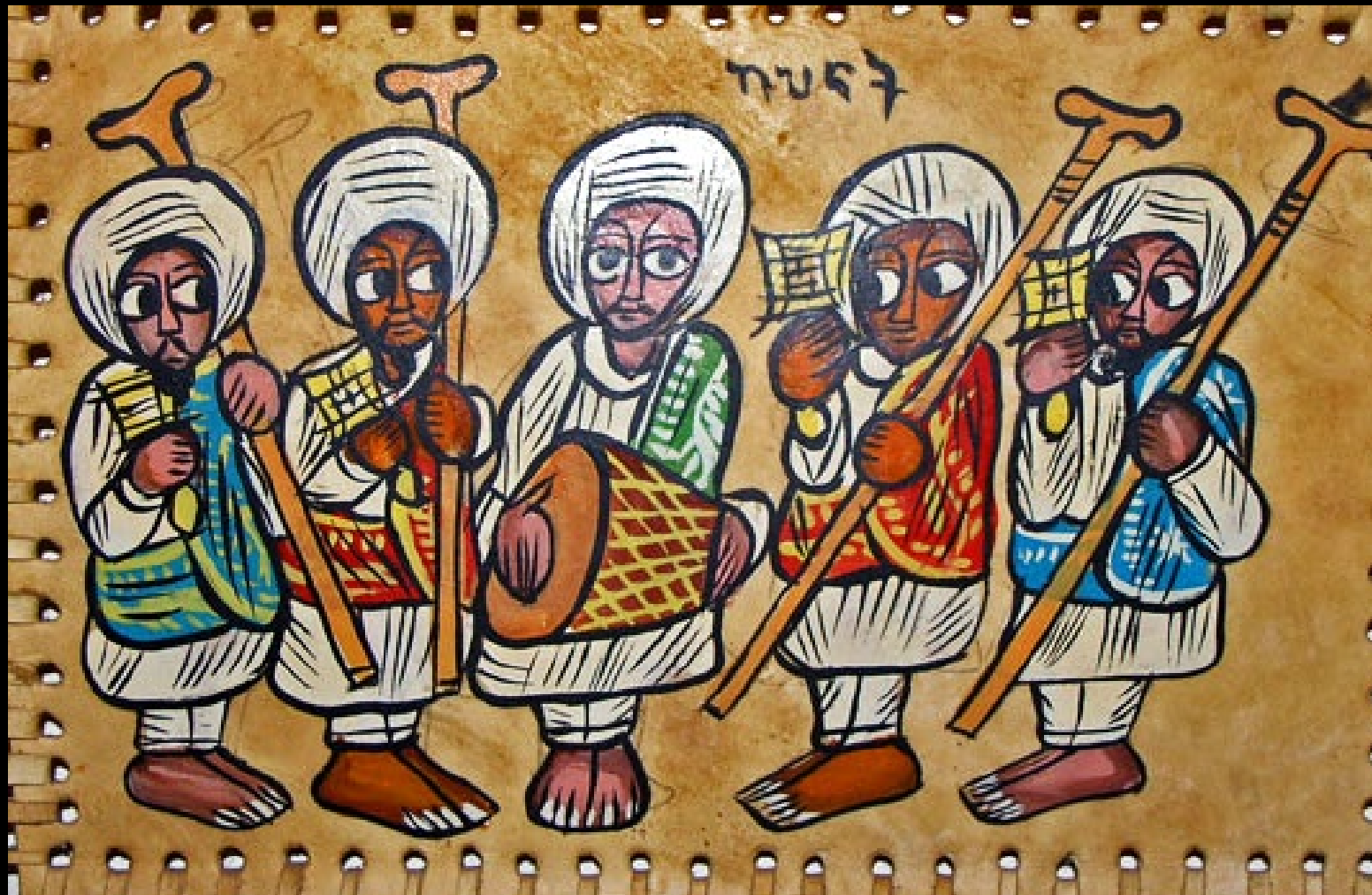
Ethiopian Orthodox Choir -- Paint on stretched leather