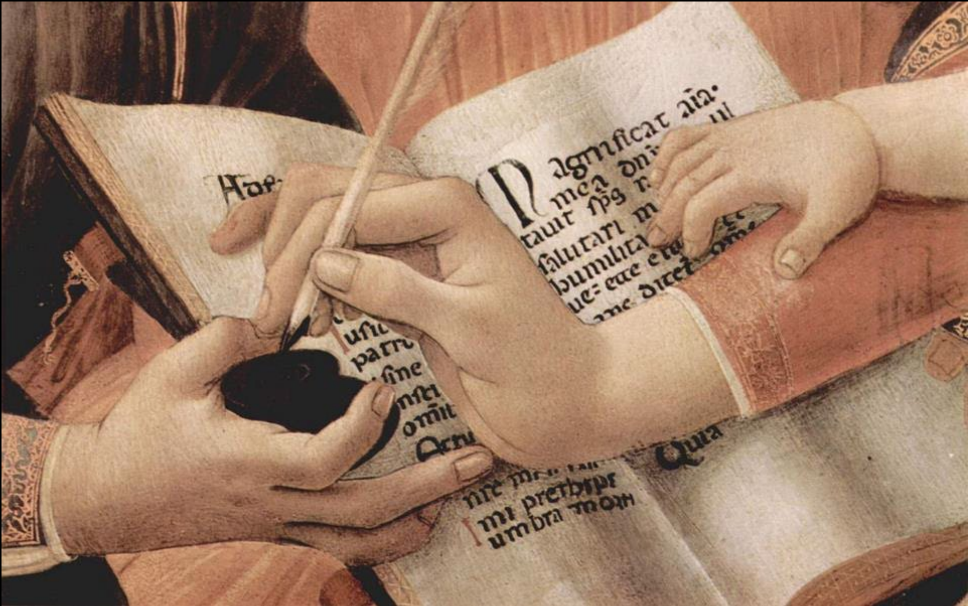
Madonna of the Magnificat -- Botticelli, Uffizi, Florence, Italy