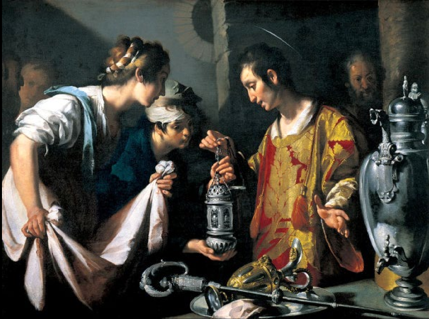
St. Lawrence Distributing the Riches of the Church -- Bernardo Strozzi, St. Louis Art Museum