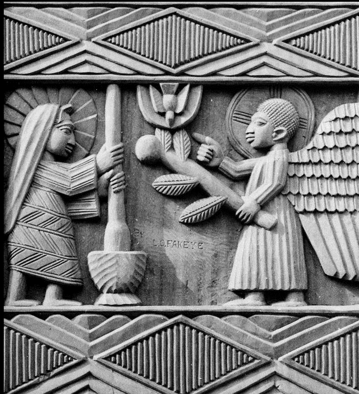
Annunciation to Mary