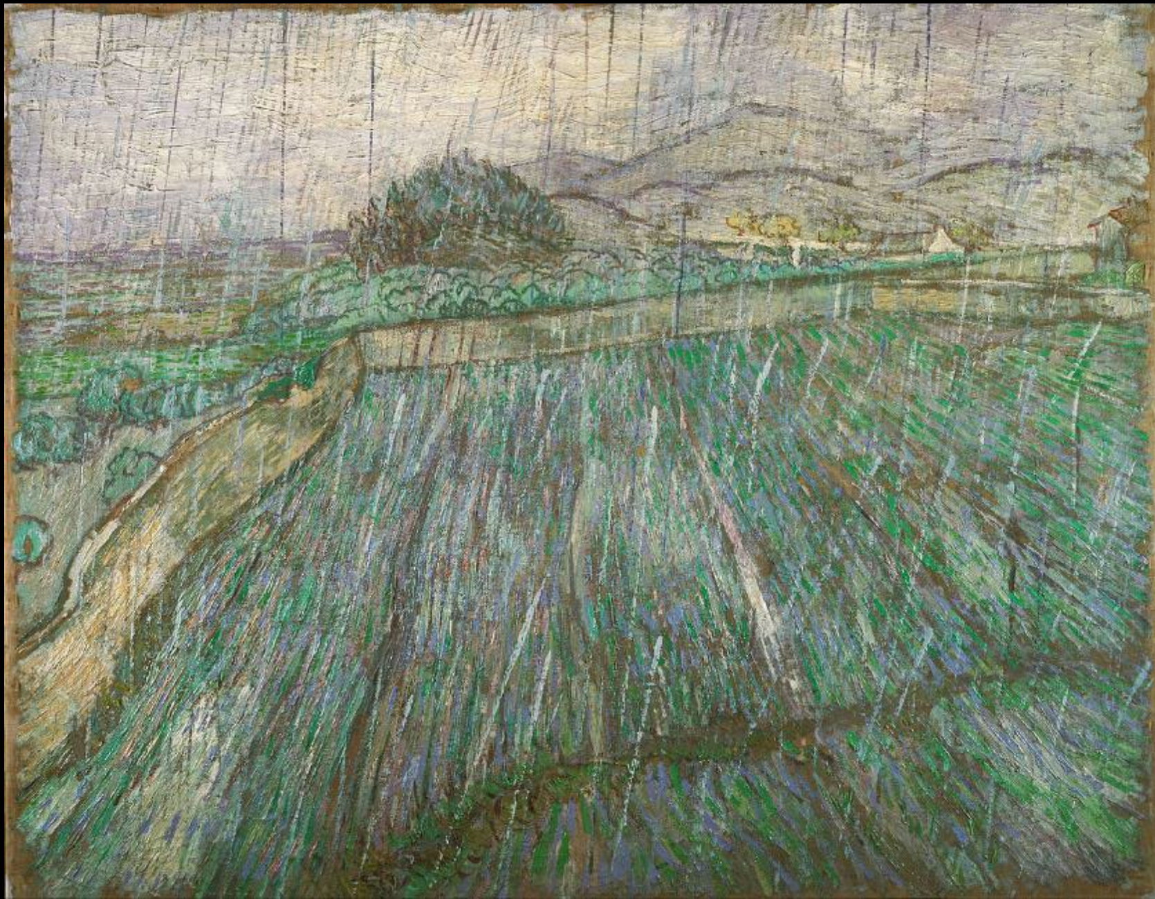
Wheat Field in Rain -- Vincent van Gogh, Philadelphia Museum of Art