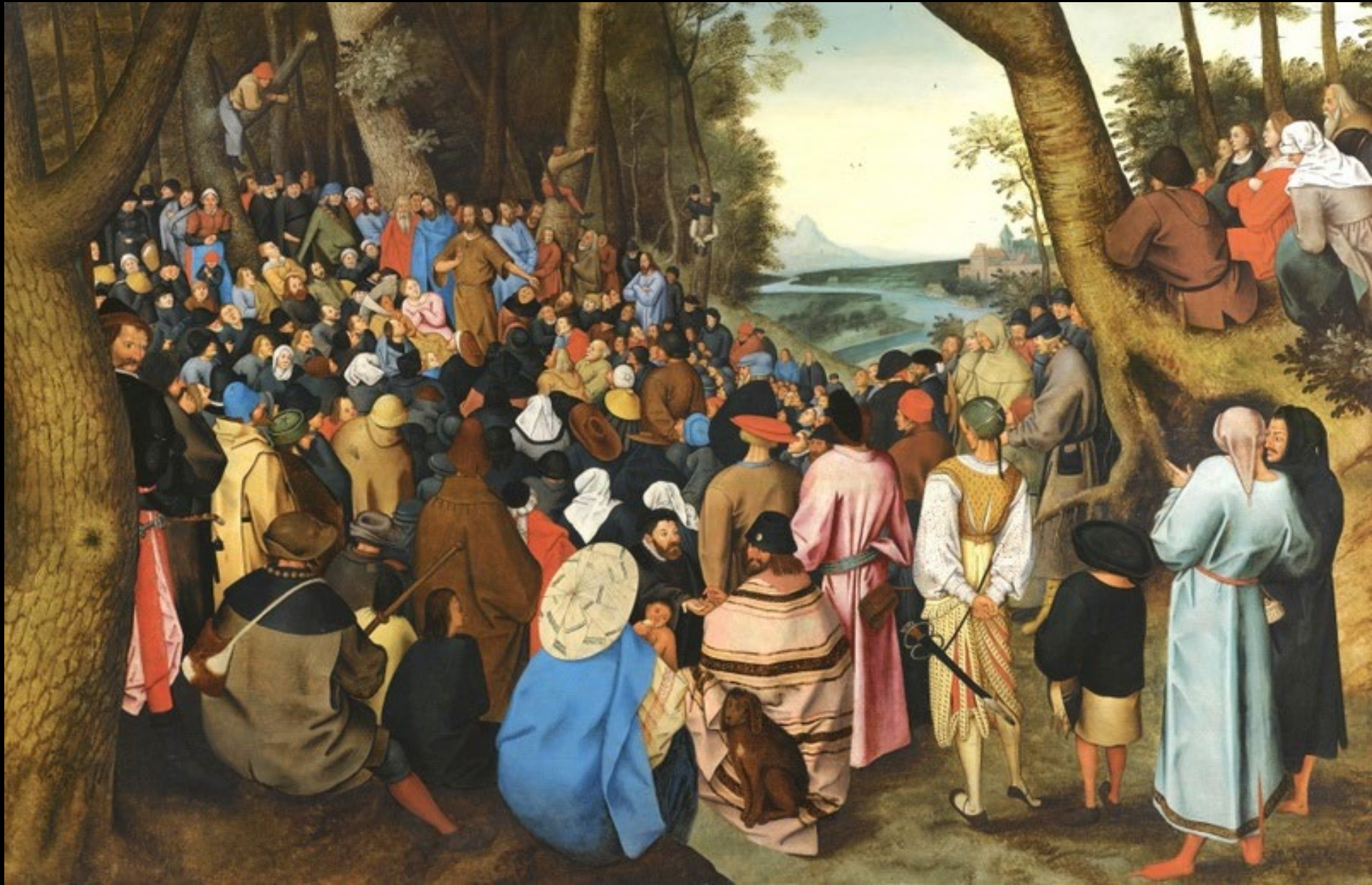
John the Baptist Preaching to the Masses – Pieter Bruegel the Younger