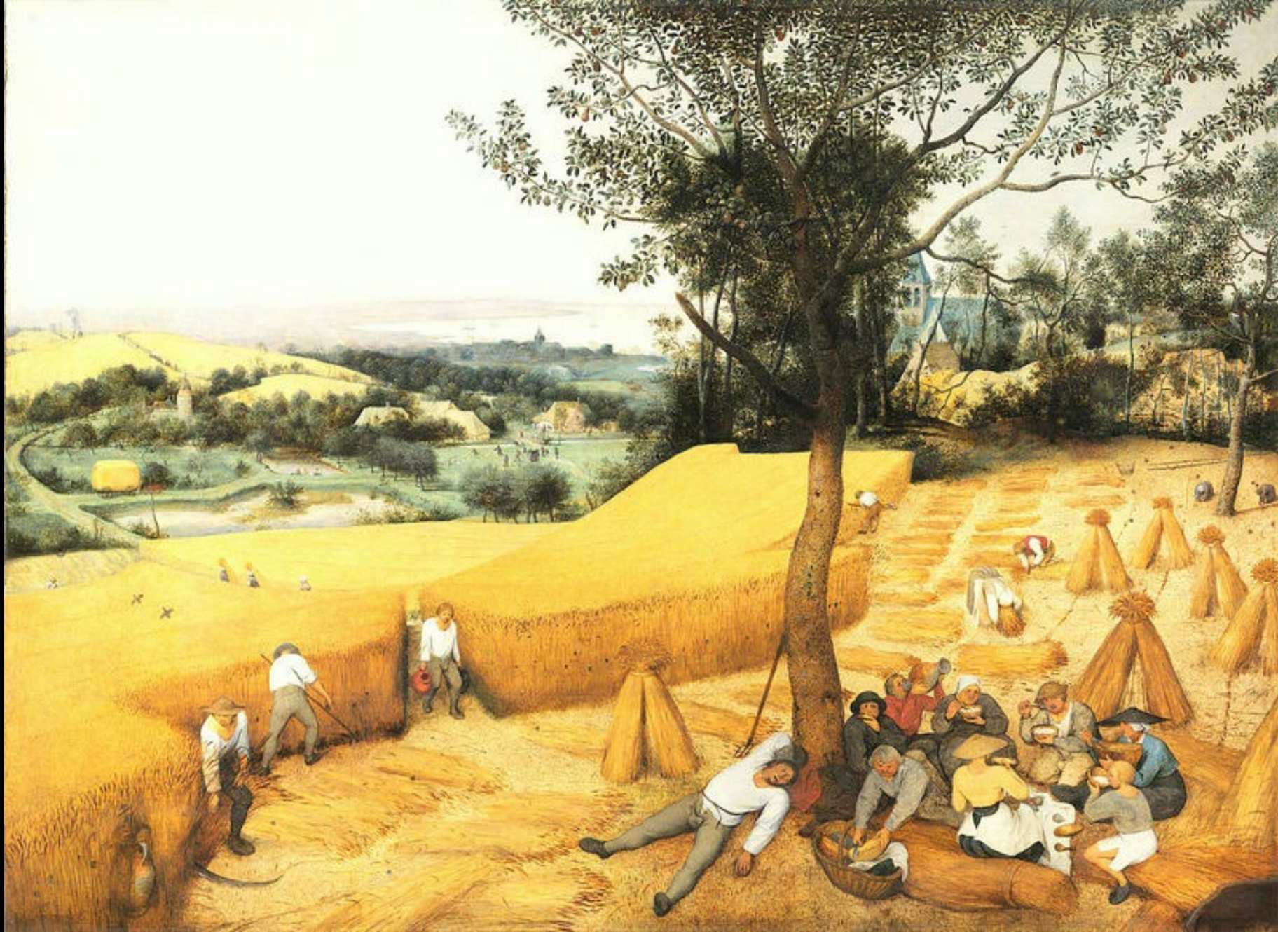
Harvesters -- Pieter Bruegel -- Metropolitan Museum of Art