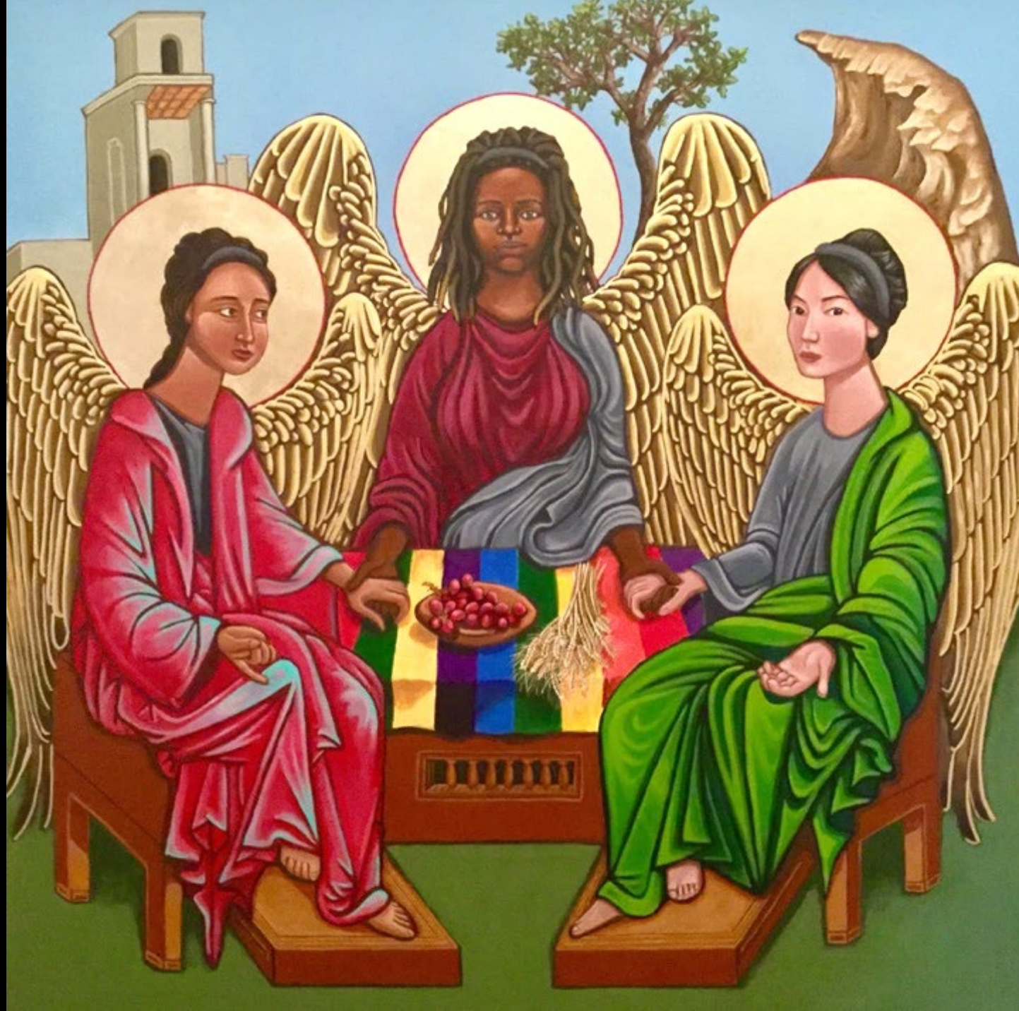
Holy Trinity (Eastern Orthodox)