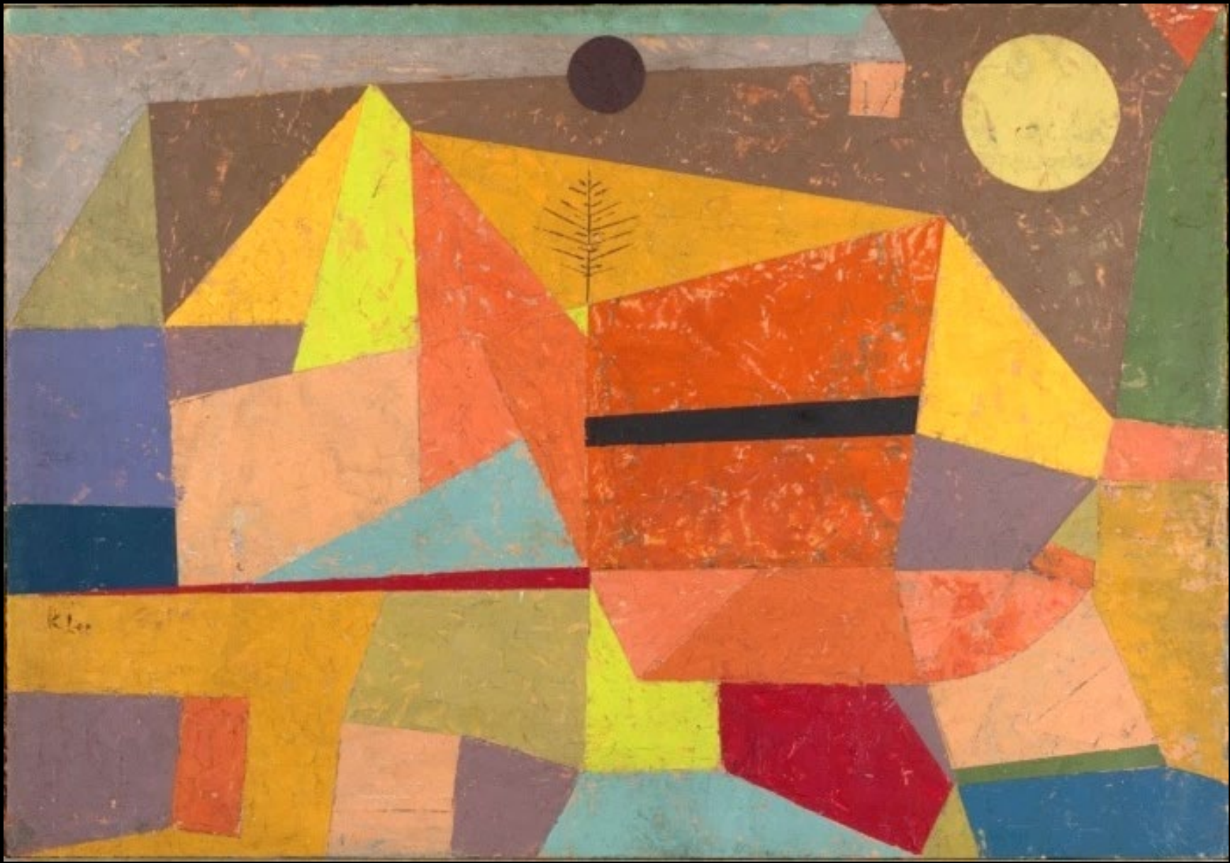
Joyful Mountain Landscape – Paul Klee, Yale University Art Gallery, New Haven, CT