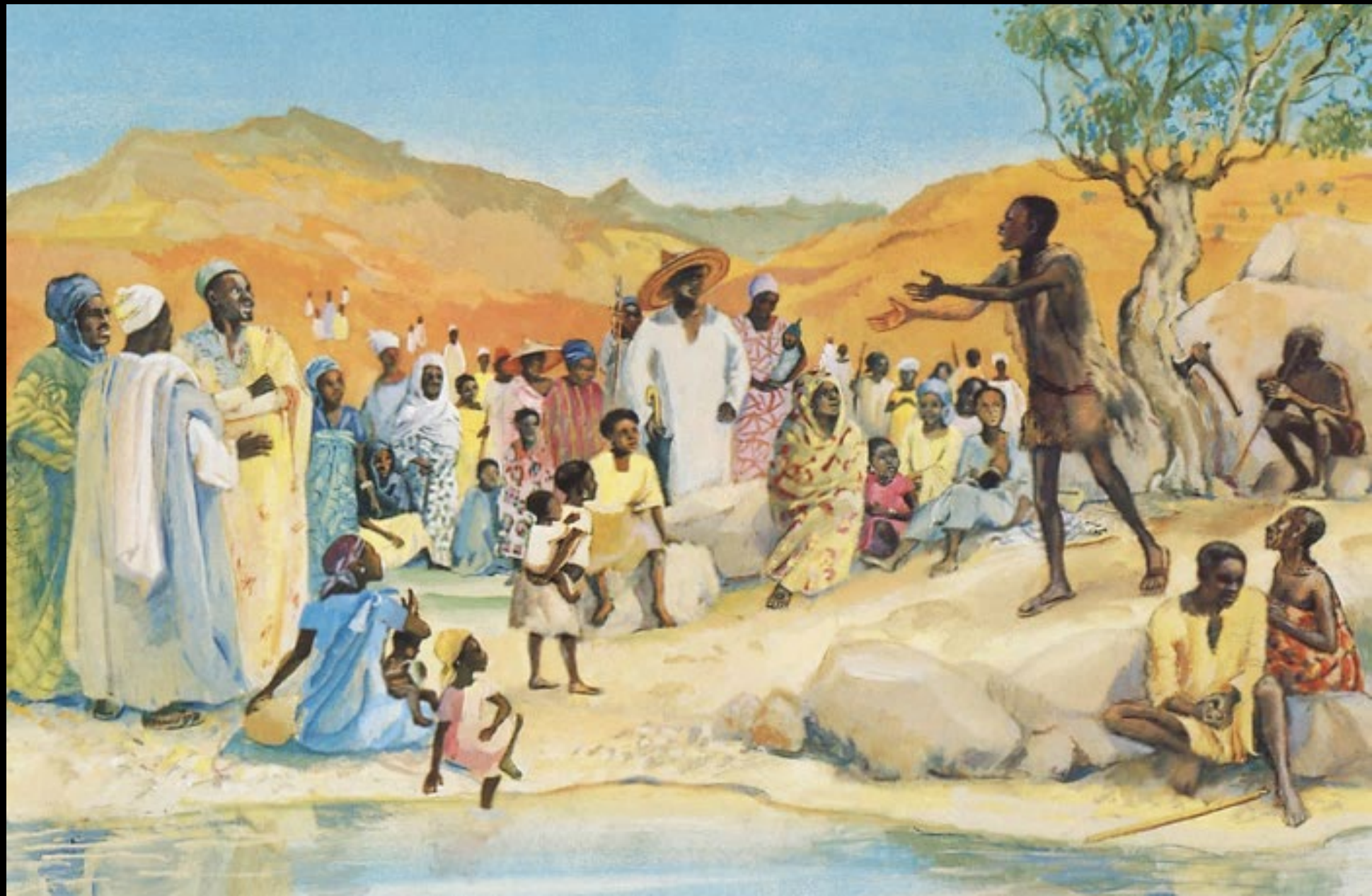
John the Baptist Preaching in the Desert – JESUS MAFA, Cameroon