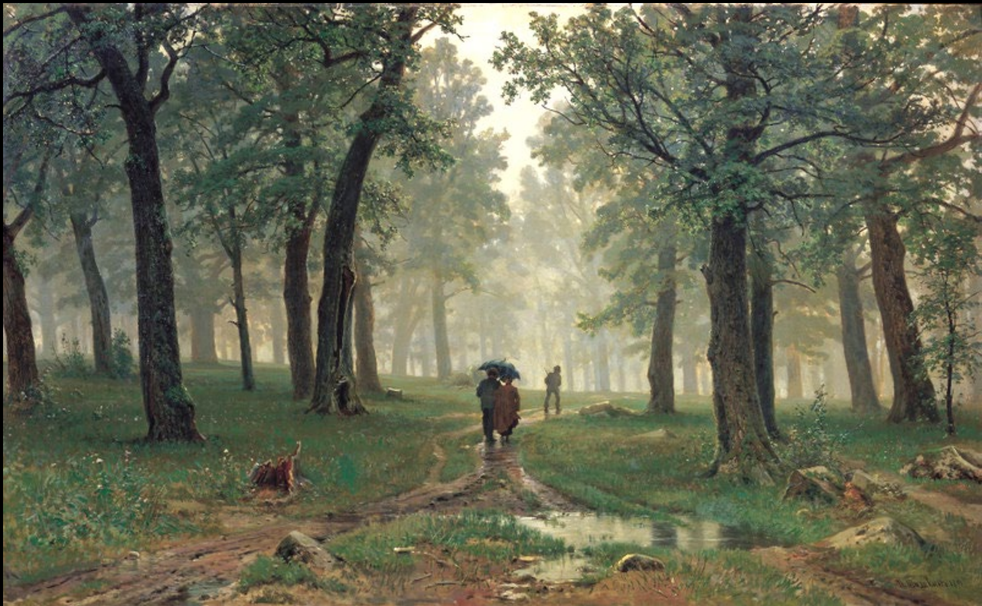
Rain in an Oak Forest -- Ivan Shishkin , Tretyakov Gallery, Moscow, Russia