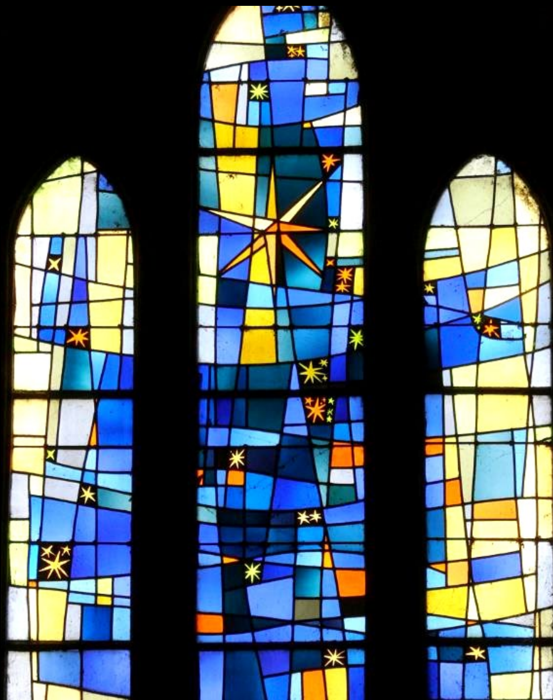
Heavenly Star Chapelle Notre Dame de Grace Villeneuve-sur-Lot, France