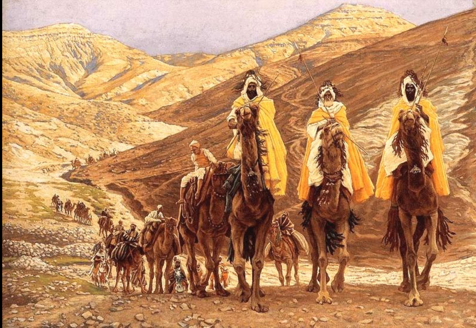
Journey of the Magi -- James Tissot, Minneapolis Institute of Art