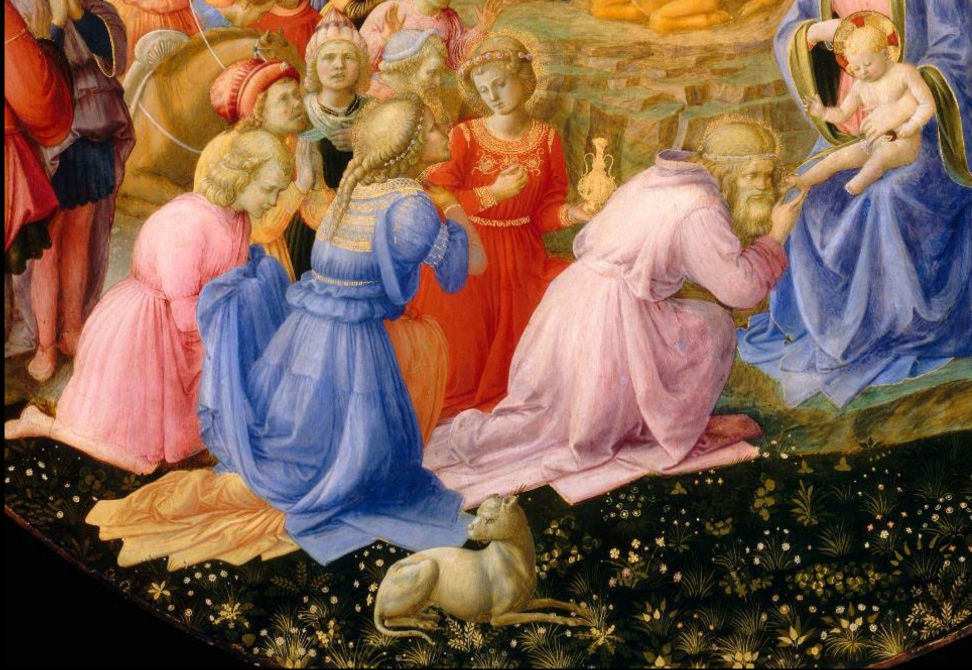
Adoration of the Magi -- Fra Angelico and Filippo Lippi, National Gallery of Art, Washington, DC