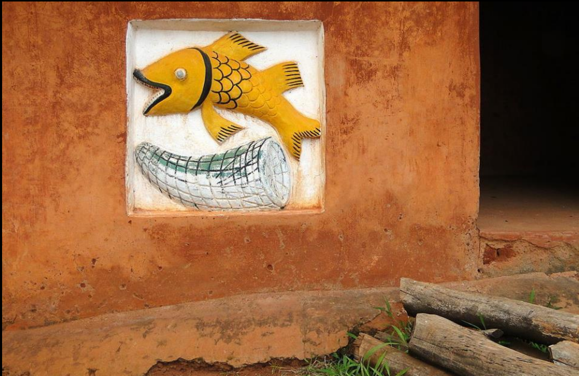
Fish Symbol on Shrine Wall -- Abomey, Benin