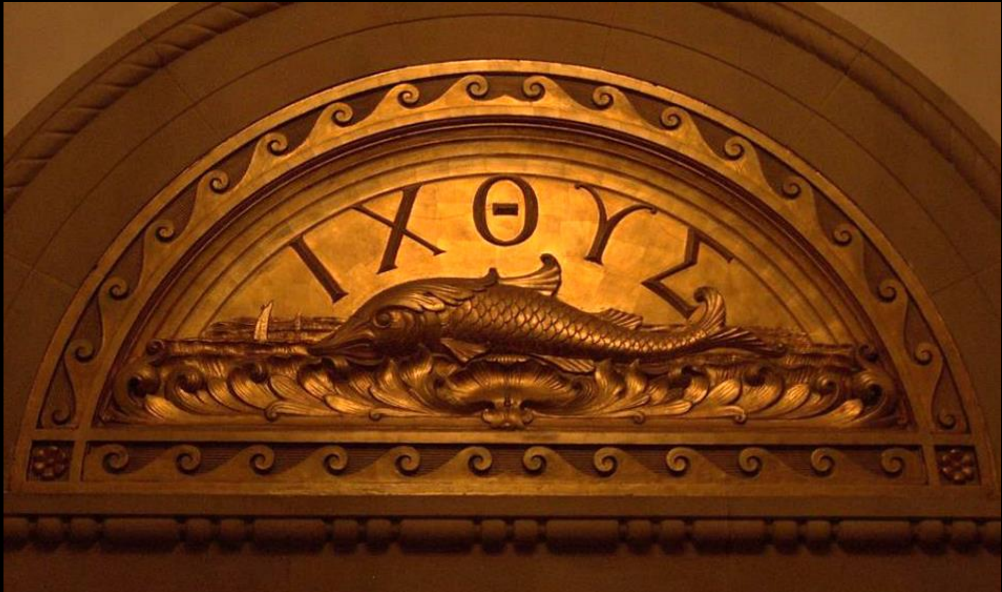
Ixthus Door -- Brite Divinity School, Texas Christian University, Fort Worth, TX