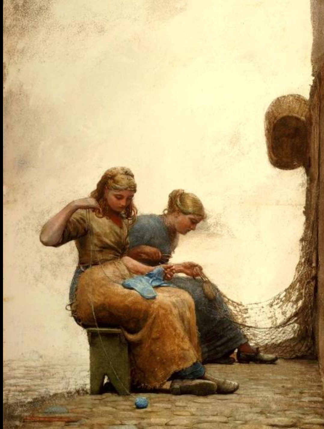
Mending the Nets Winslow Homer National Gallery of Art Washington, DC