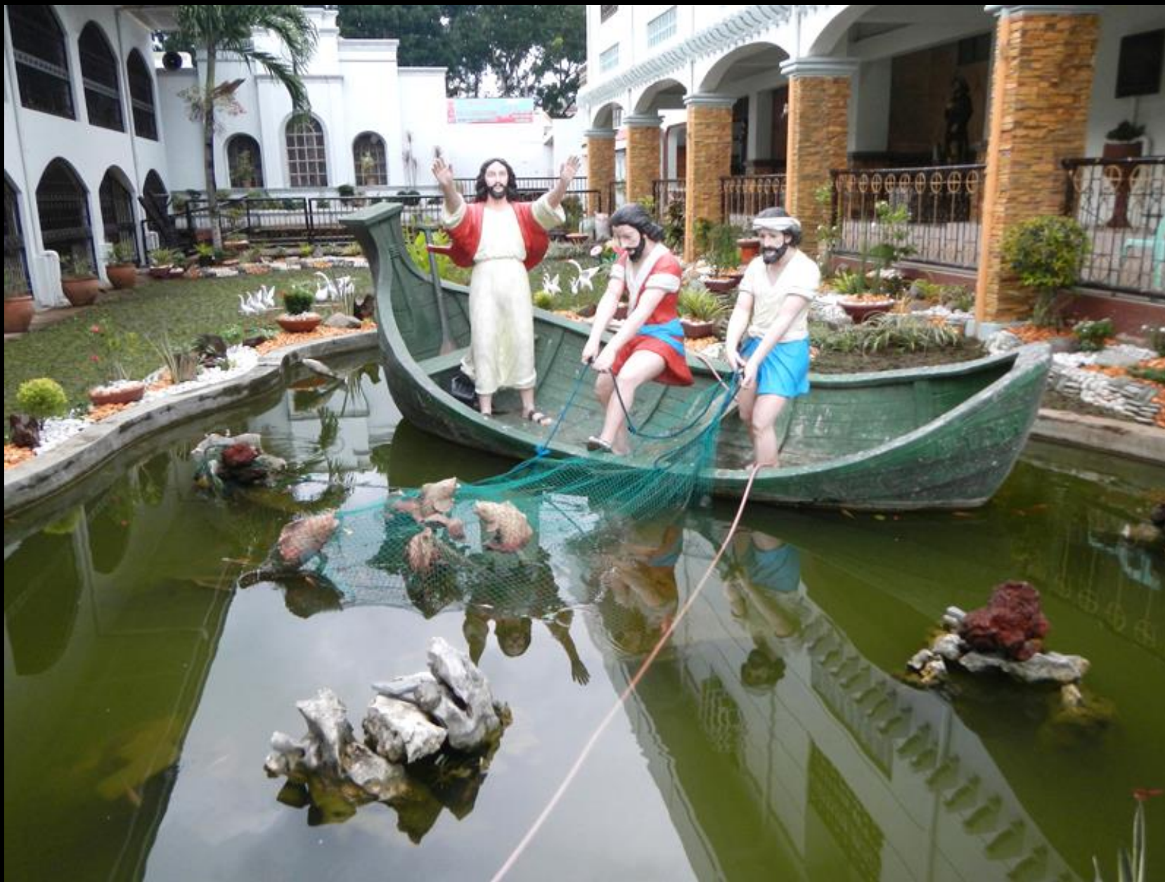
Christ Calling the Disciples -- Nuestra Senora de la Candelaria, Candelaria, Philippines