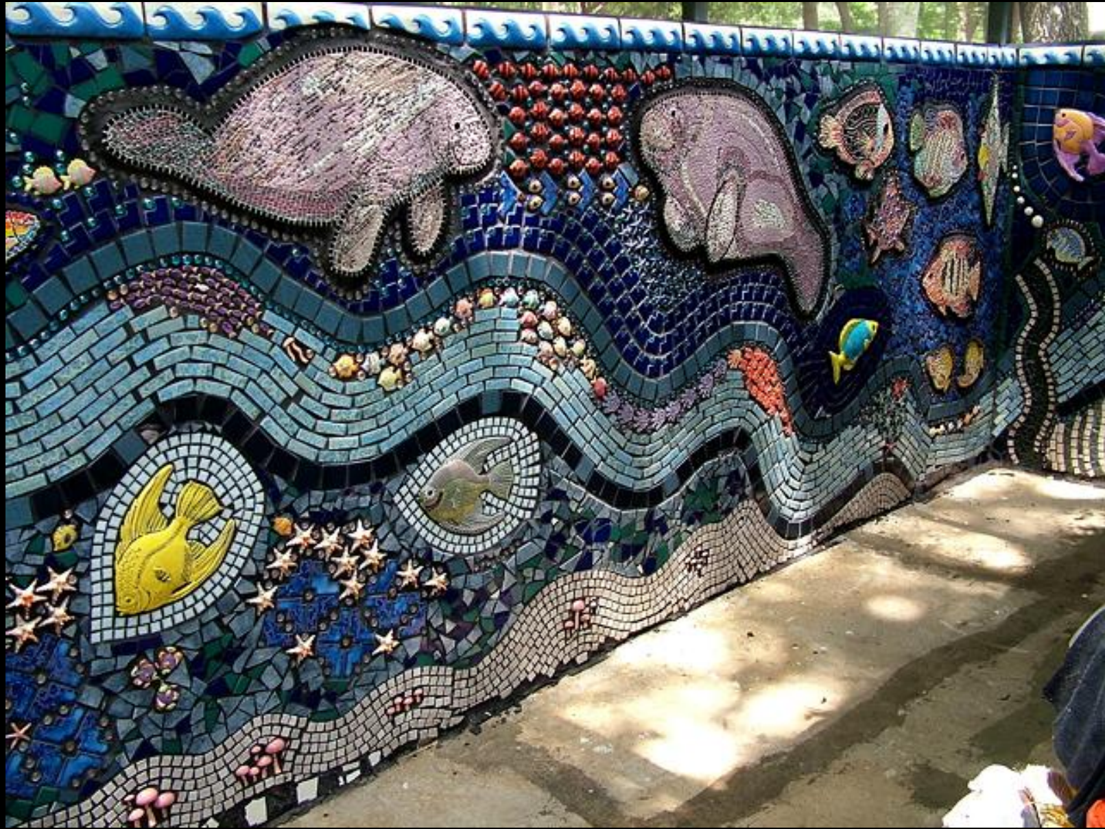
Fish Wall East -- Mosaic with Creation motif, Apopka, FL