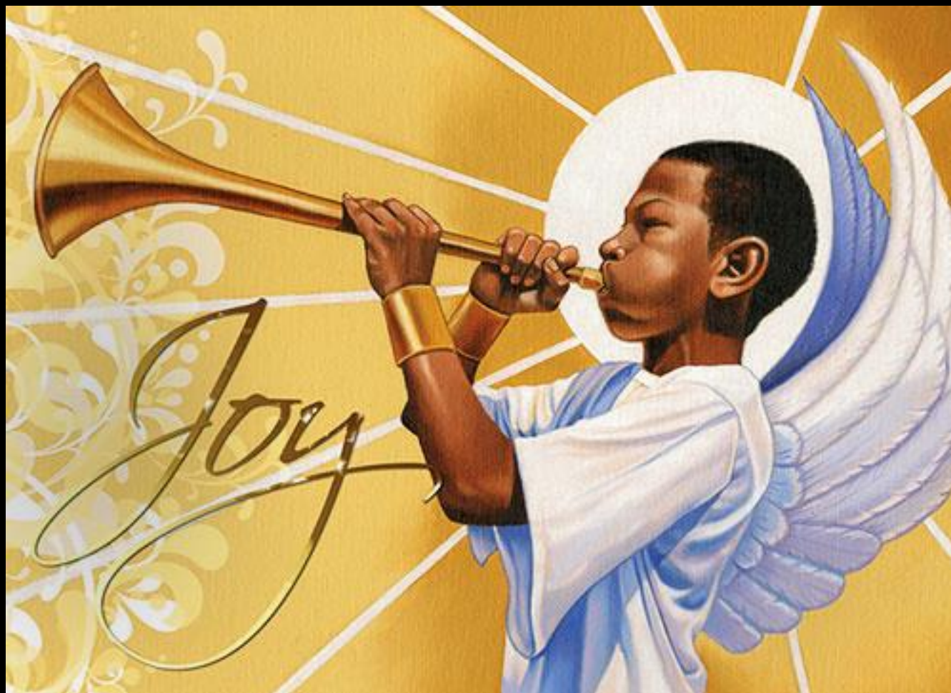
Joy to the World, the Lord is Come -- Illustration from Dem. Republic of Congo