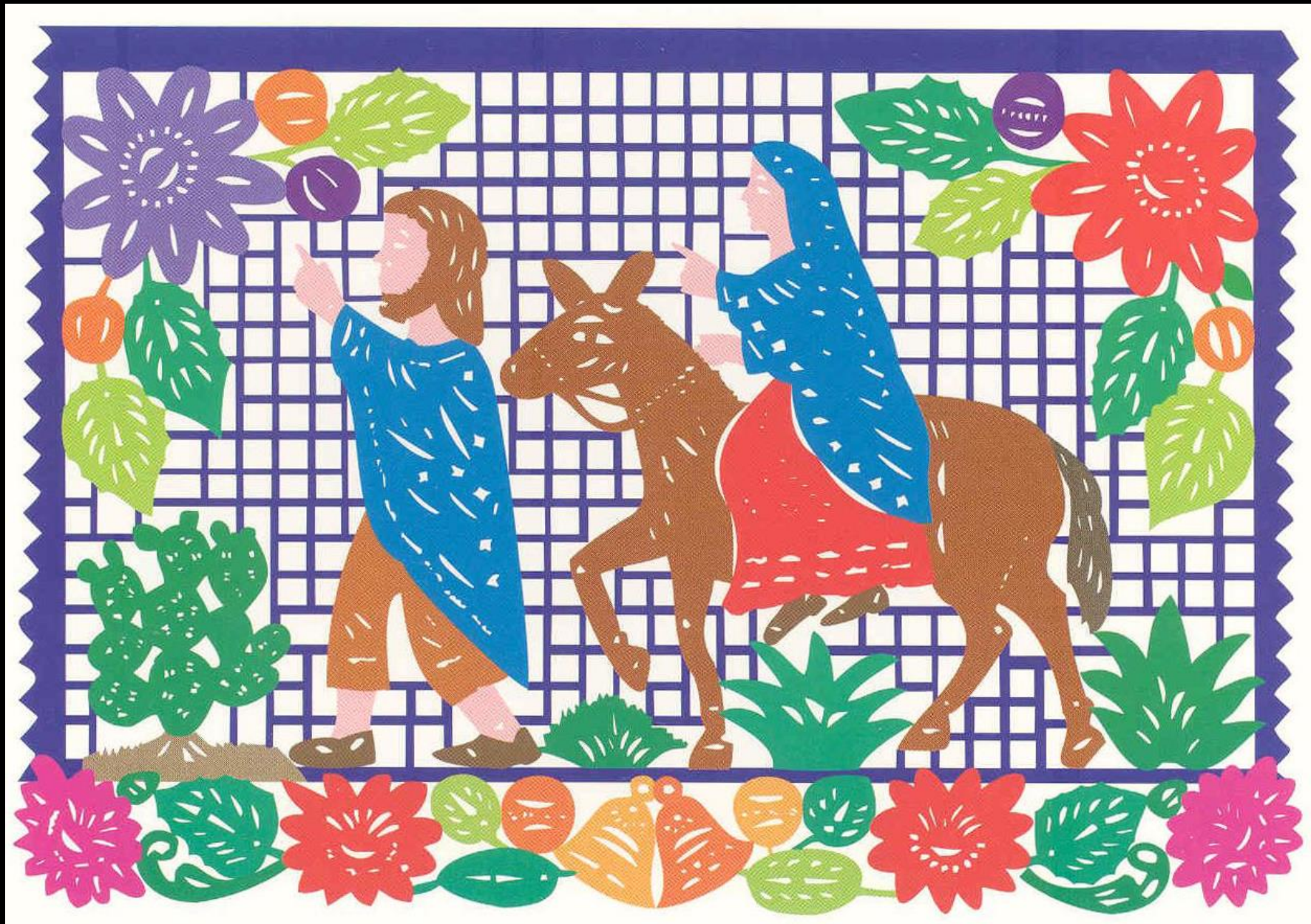
Traveling to Bethlehem -- Mexican cut paper art