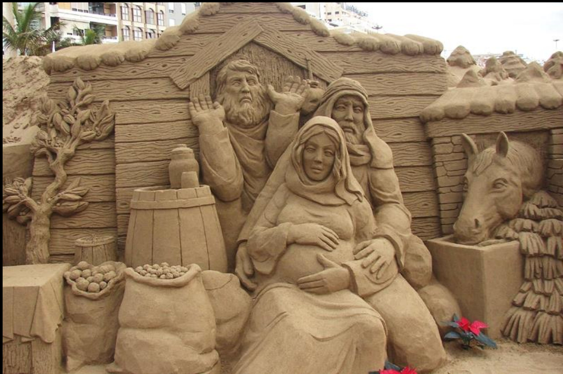
No Room in the Inn -- Peter Busch, Sand sculpture, Canary Islands, Spain