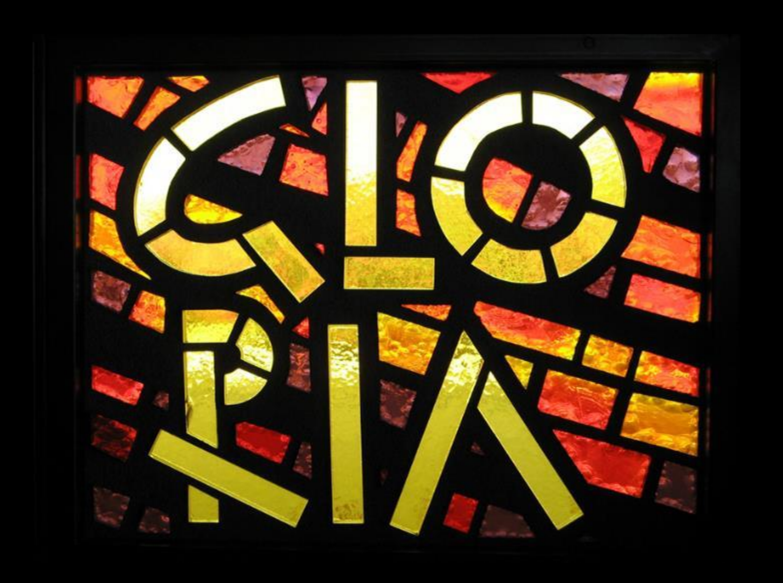
Gloria! -- Prince of Peace Abbey, Oceanside, CA