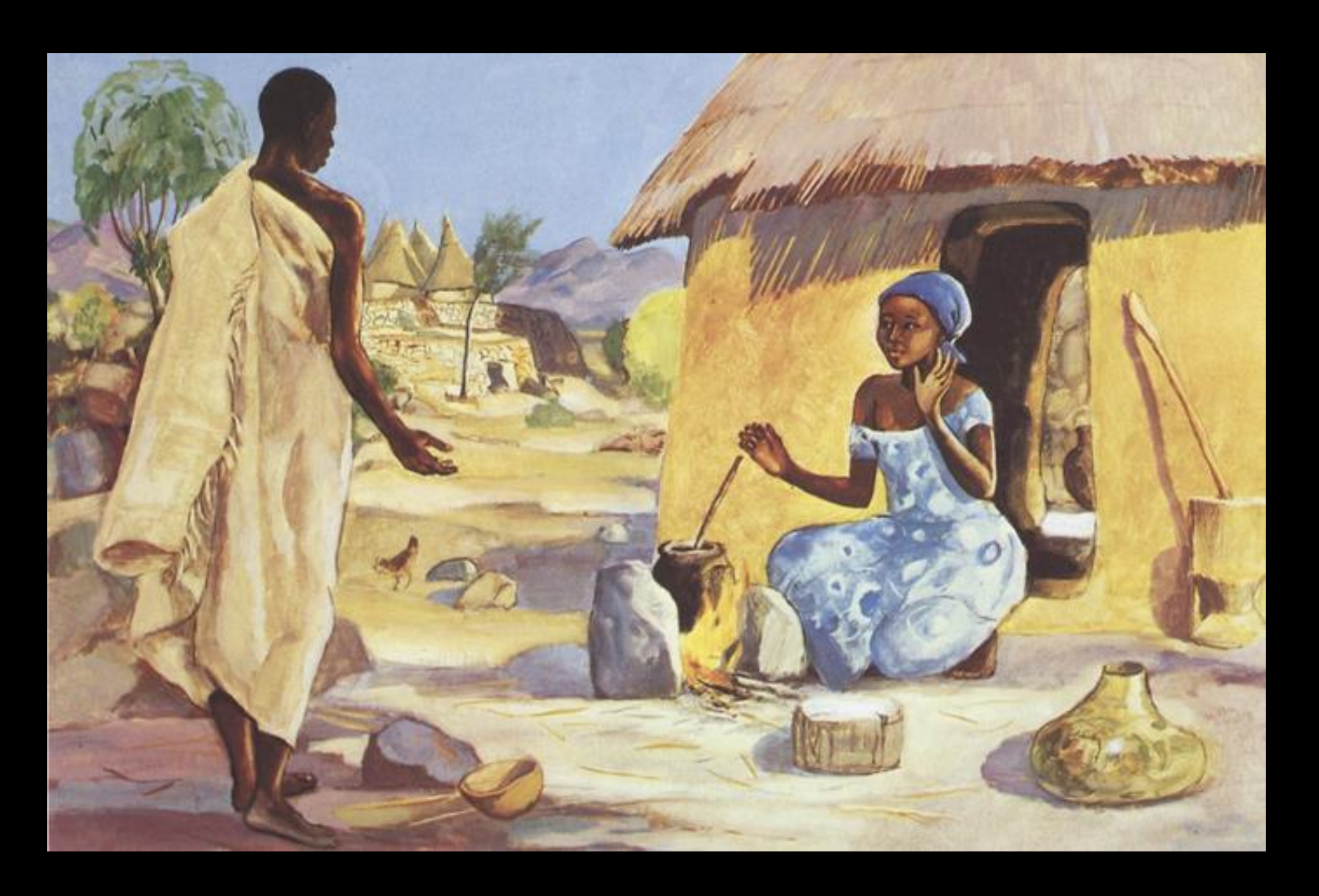
The Annunciation -- JESUS MAFA, Cameroon