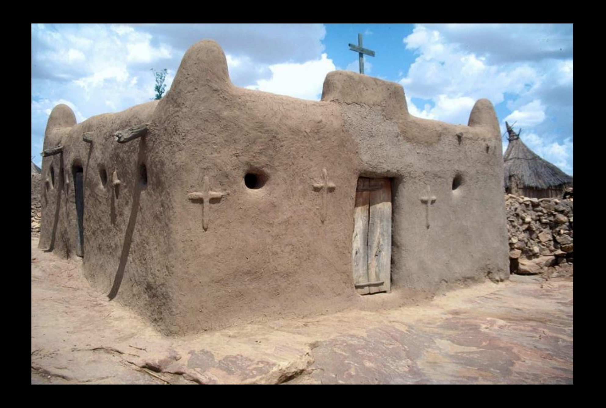
Church in a Dogon Village, Mali