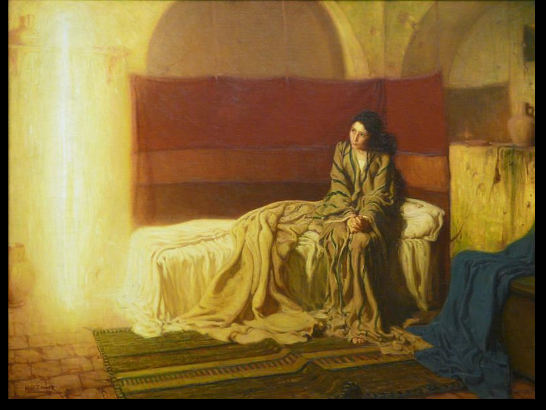
The Annunciation -- Henry Ossawa Tanner, Philadelphia Museum of Art, Philadelphia, PS