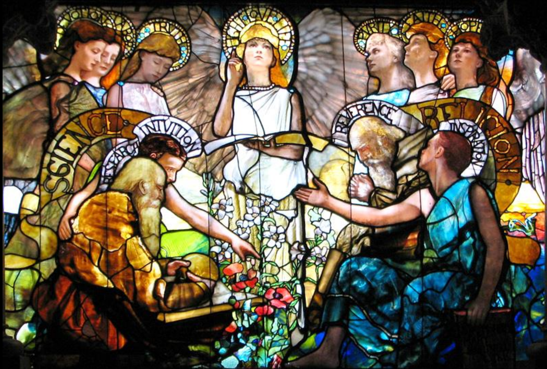
Light, Love, Life -- Louis Comfort Tiffany, Yale University, New Haven, CT