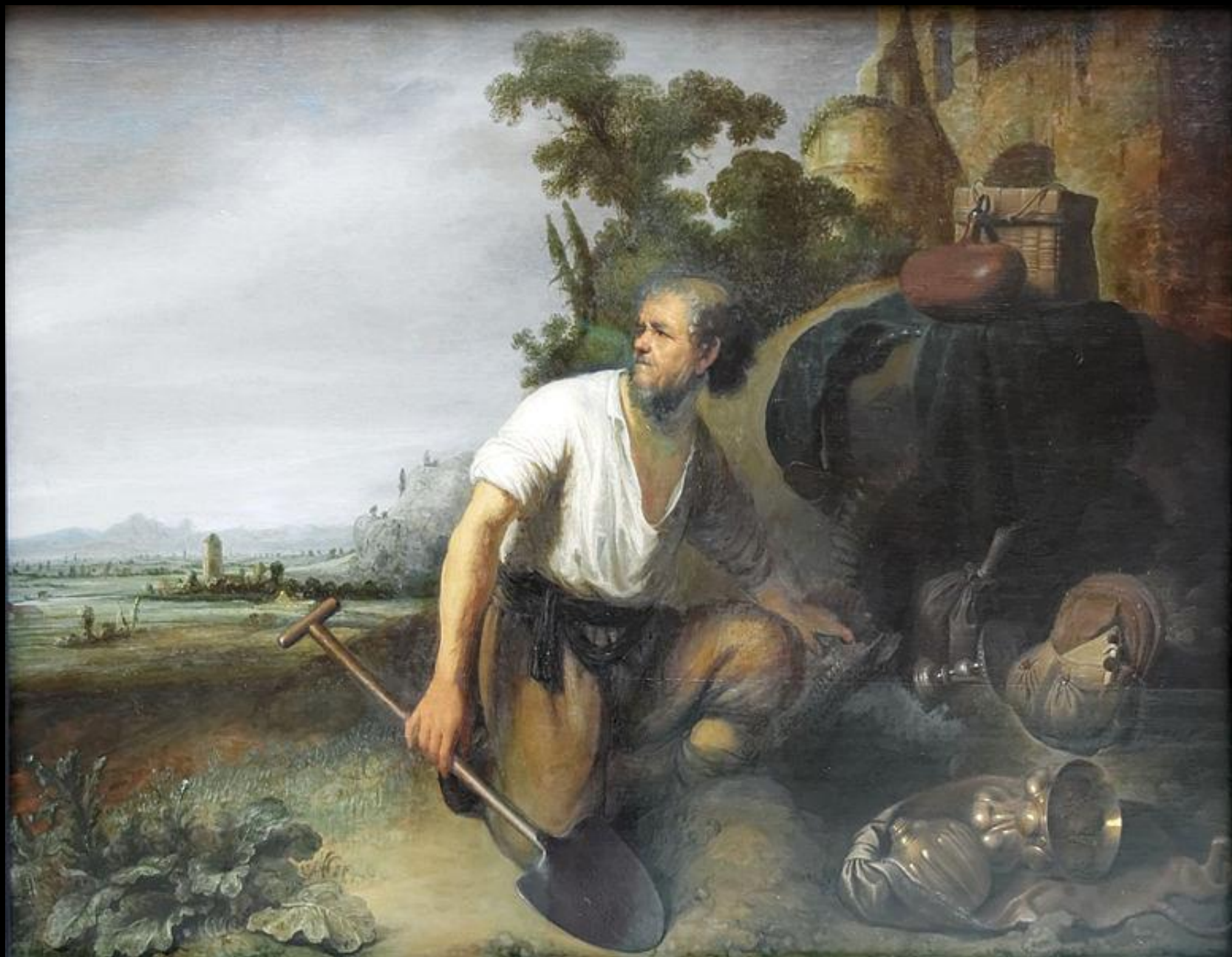
The Hidden Treasure -- Workshop of Rembrandt, Museum of Fine Arts, Budapest, Hungary