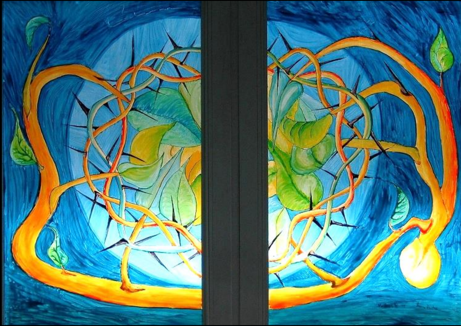
Parable of the Mustard Seed -- YMCA Training Center, Kassel, Germany