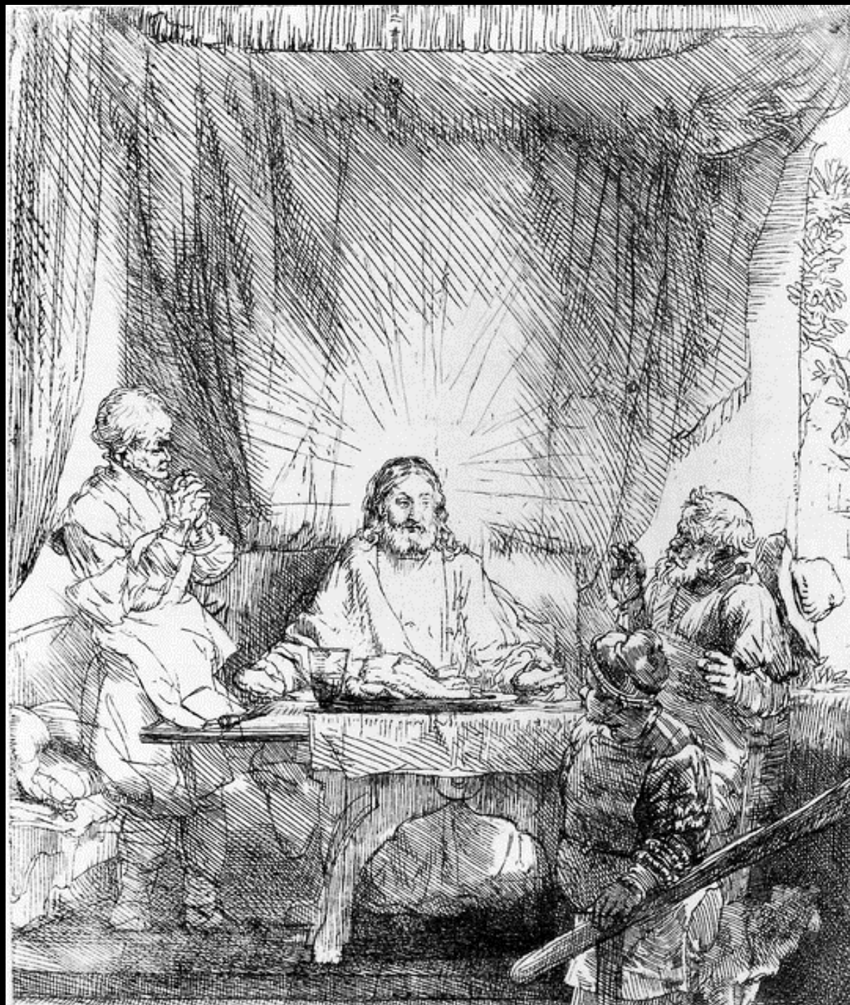
Supper at Emmaus