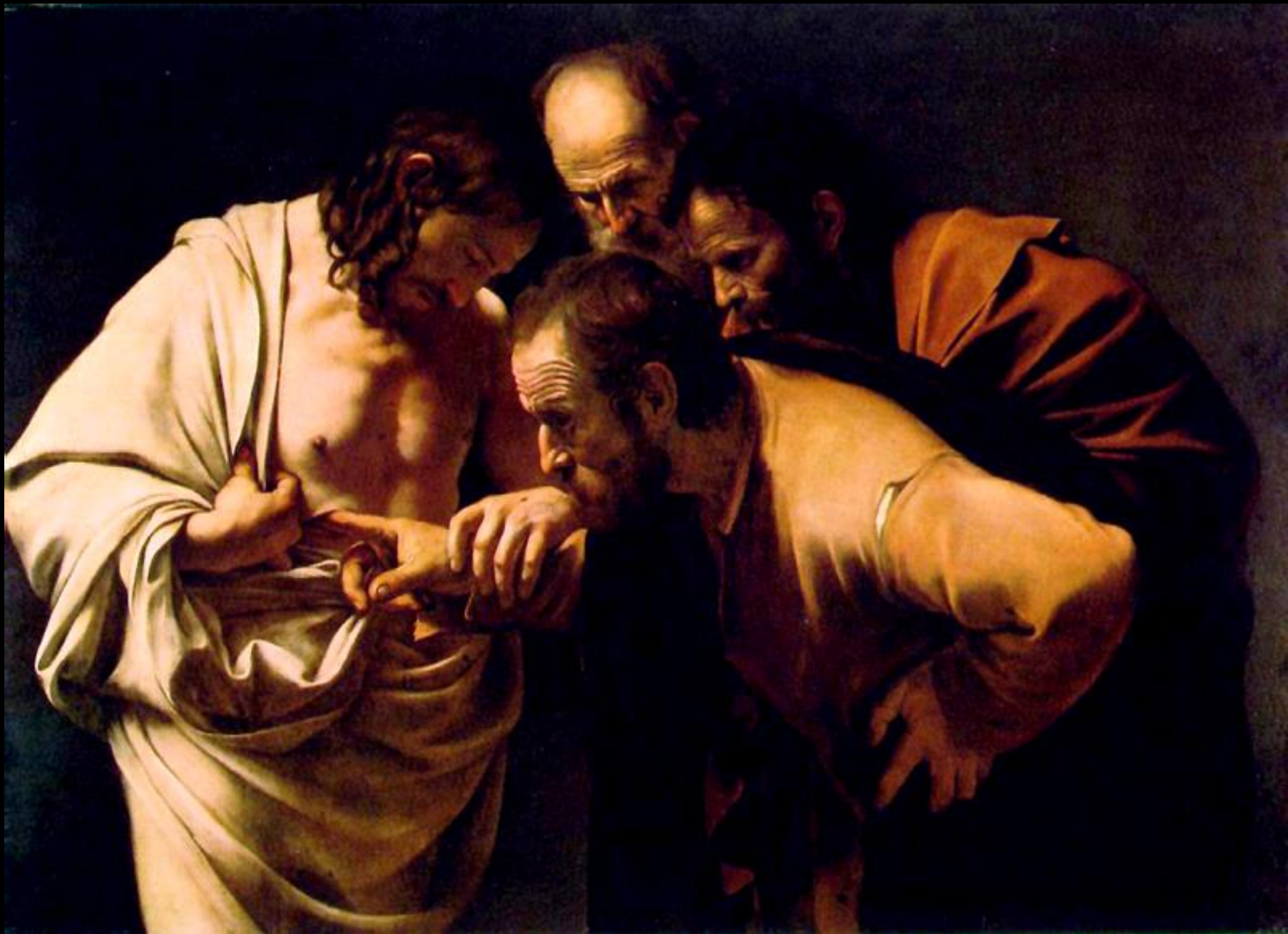
The Incredulity of Thomas -- Caravaggio, Sanssouci, Potsdam, Germany