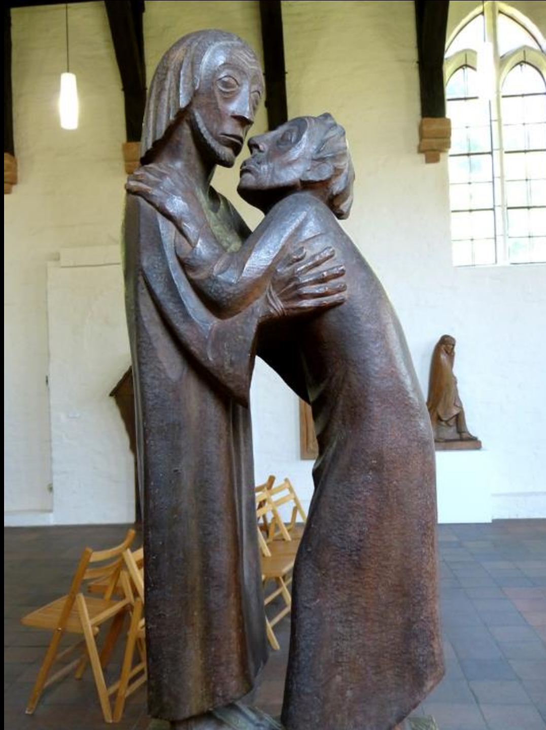
Reunion Ernst Barlach St. Gertrude's Chapel Gustrow, Germany