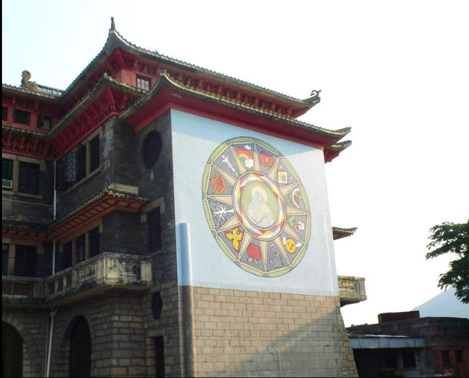
Holy Spirit Seminary -- Hong Kong, China