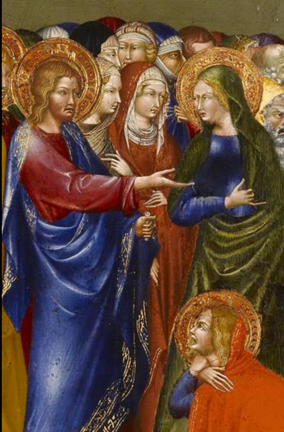
Raising of Lazarus

Giovanni di Paolo Walters Art Museum, Baltimore, MD