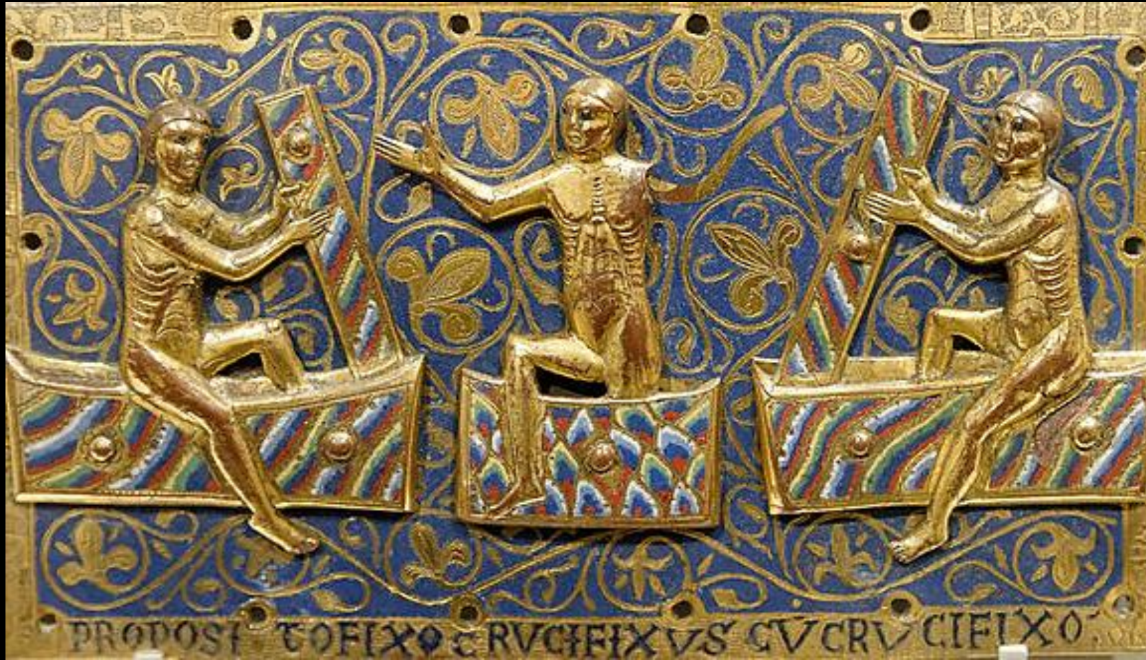
Resurrection of the Dead -- Limoges, Victoria and Albert Museum, London