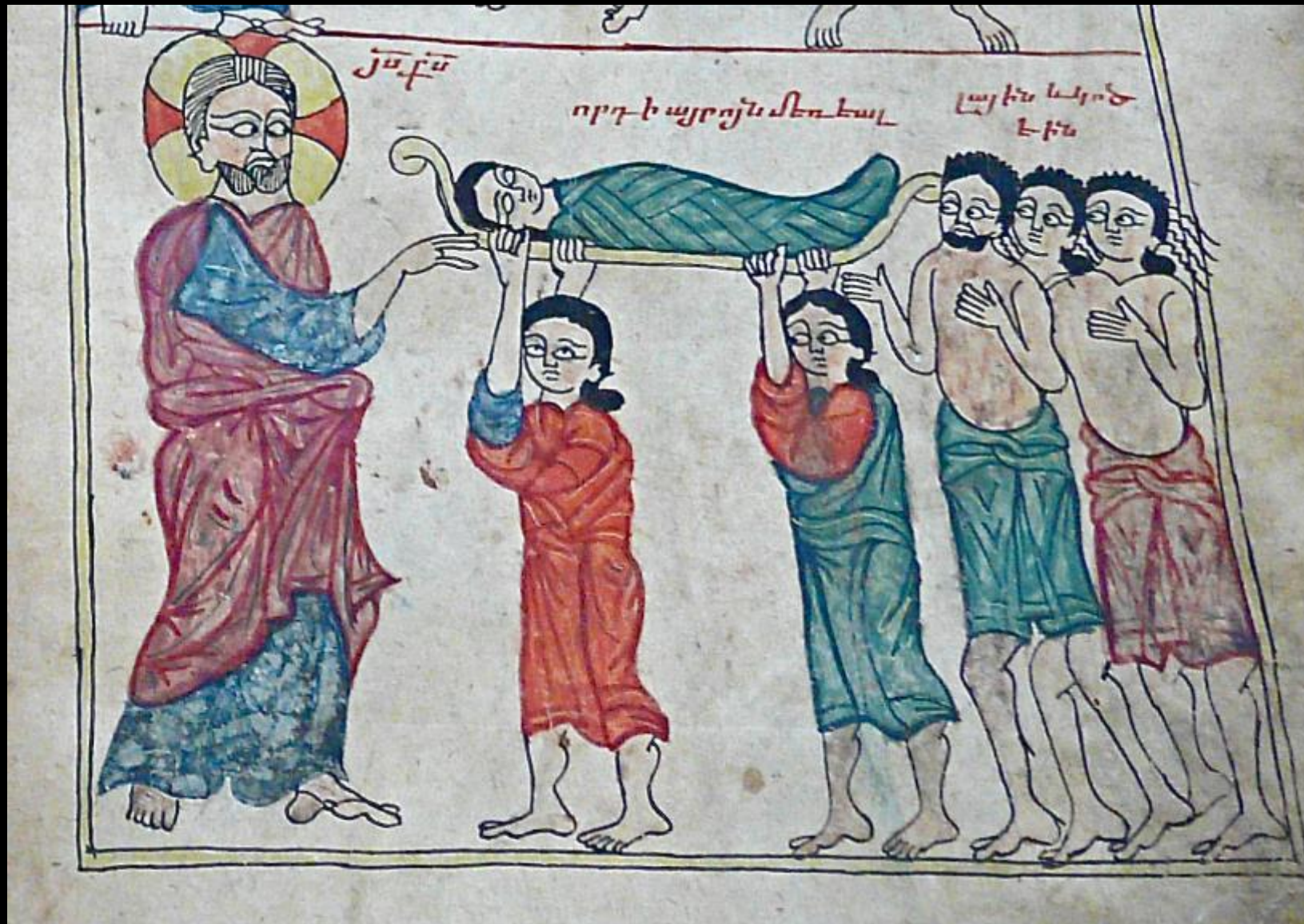
Gospel of Lazarus, 887 AD -- Mesrops Mashtots Institute of Ancient Manuscripts, Yerevan, Armenia