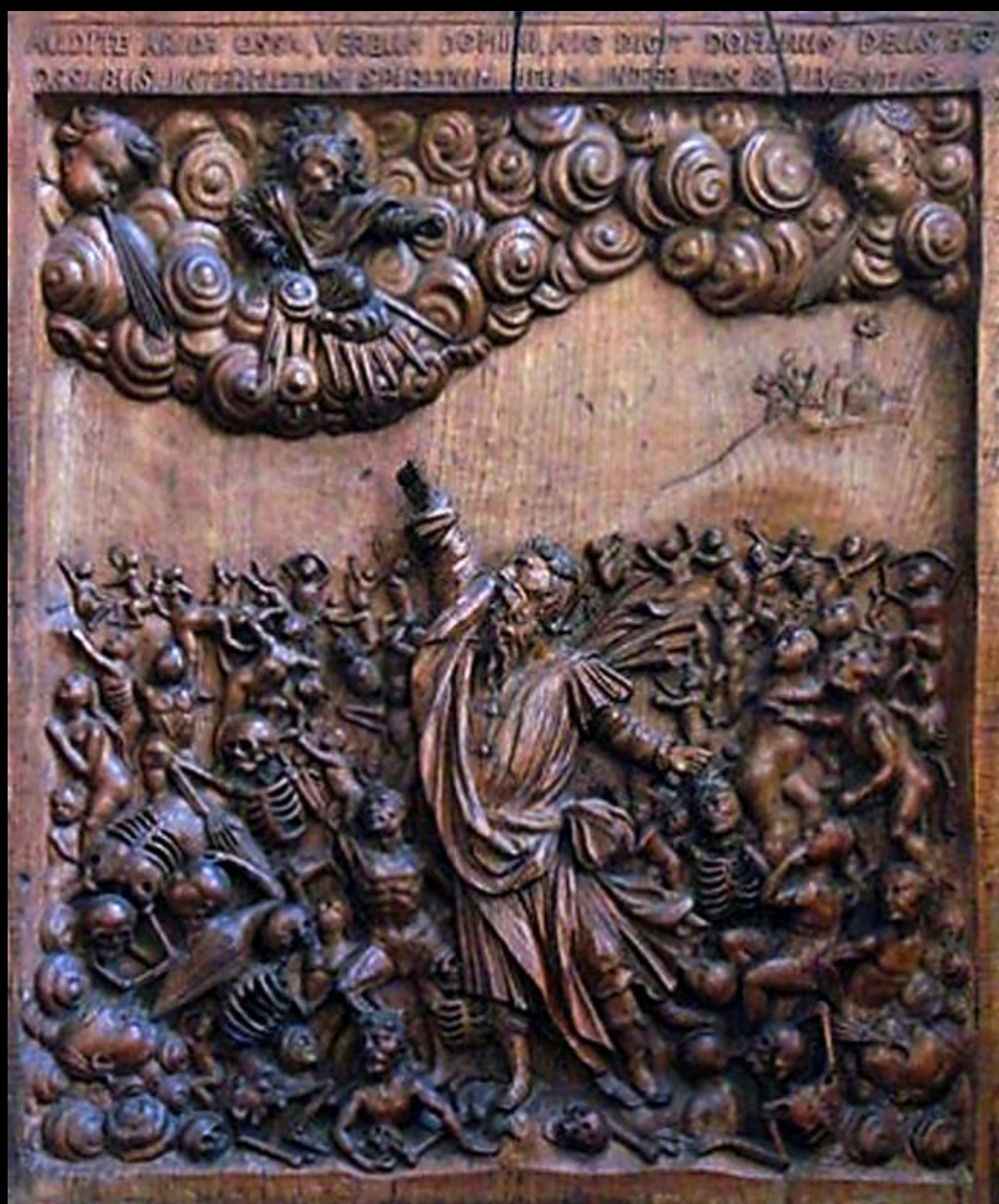
Ezekiel in Valley of Bones

St Nicholas Church Deptford Green, England