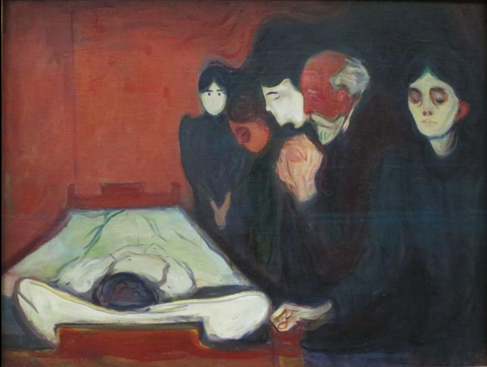
At the Deathbed -- Edvard Munch, Bergen Kunstmuseum, Bergen, Norway