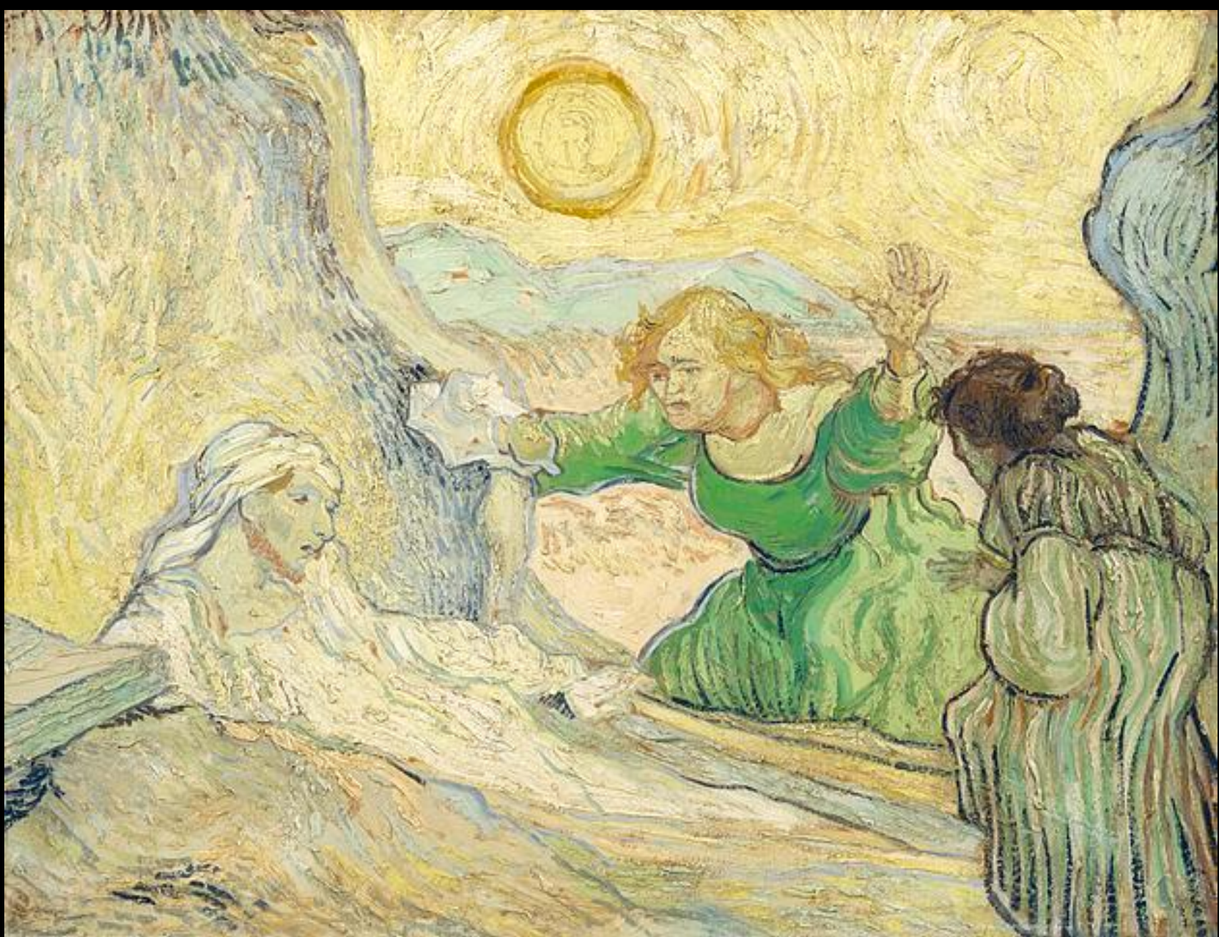
Resurrection of Lazarus -- Vincent van Gogh, Van Gogh Museum, Amsterdam