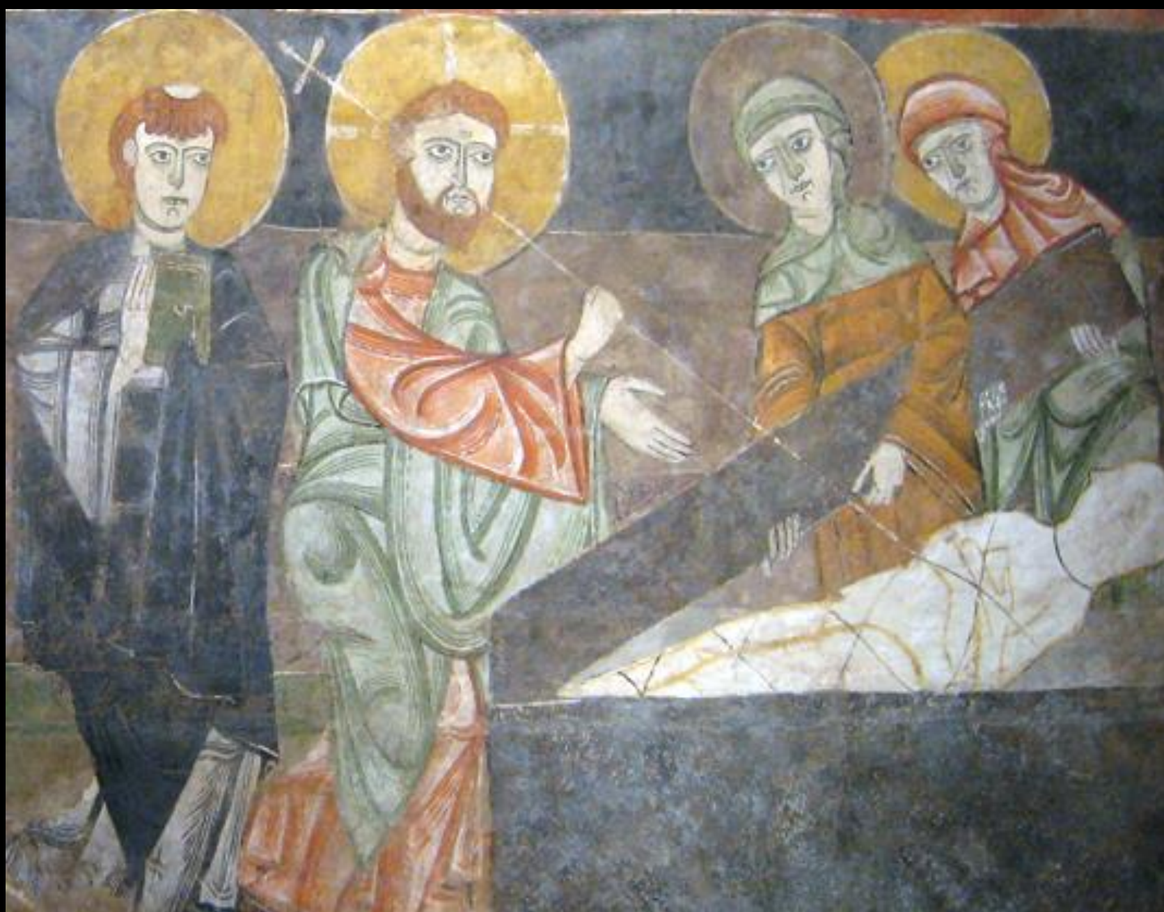
Raising of Lazarus -- Spanish, Cloisters Museum, New York City