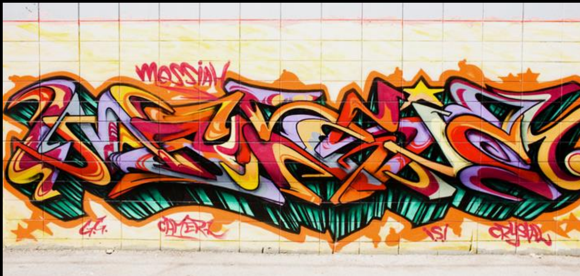
Messiah! -- Mural, San Jose, CA