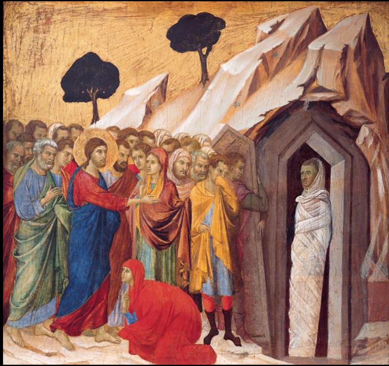
Raising of Lazarus Duccio Kimbell Art Museum Fort Worth, TX