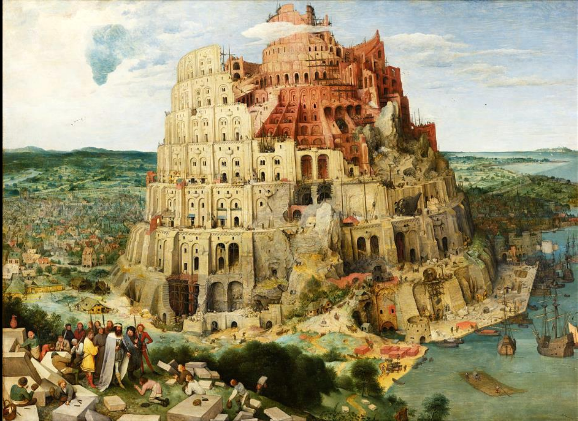
Tower of Babel -- Pieter Bruegel the Elder, Kunsthistorisches Museum, Vienna, Austria