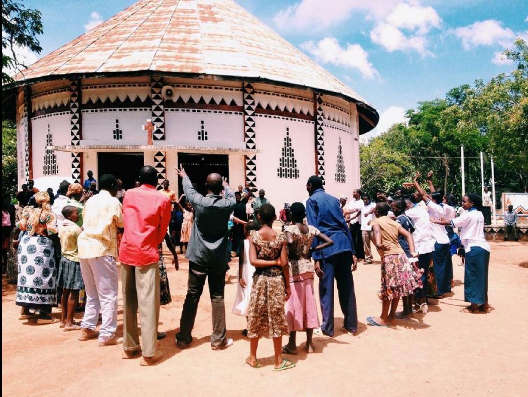
Celebration Day -- Bujora Catholic Church, Sukumaland, Tanzania