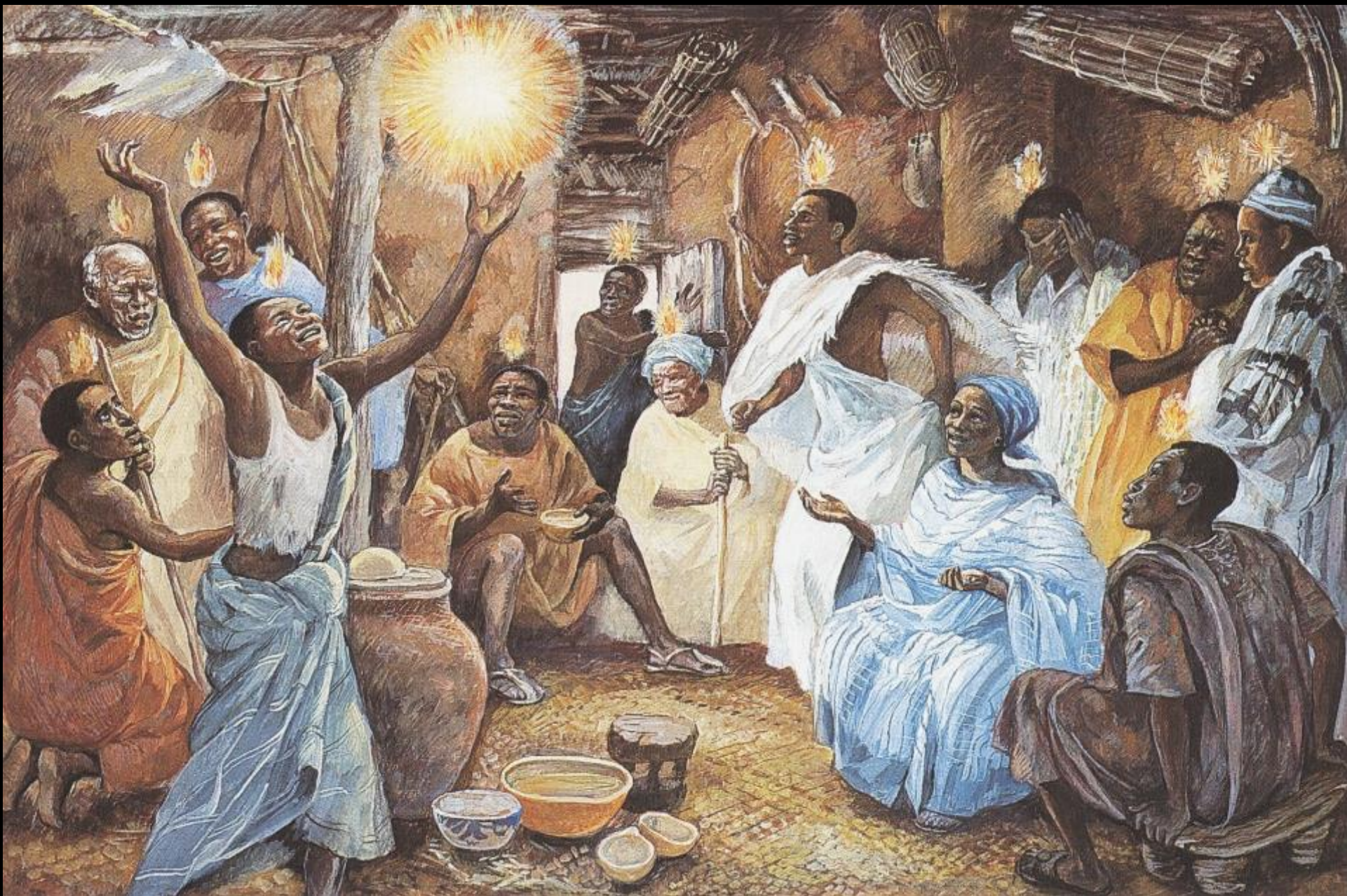
Pentecost -- JESUS MAFA, Cameroon