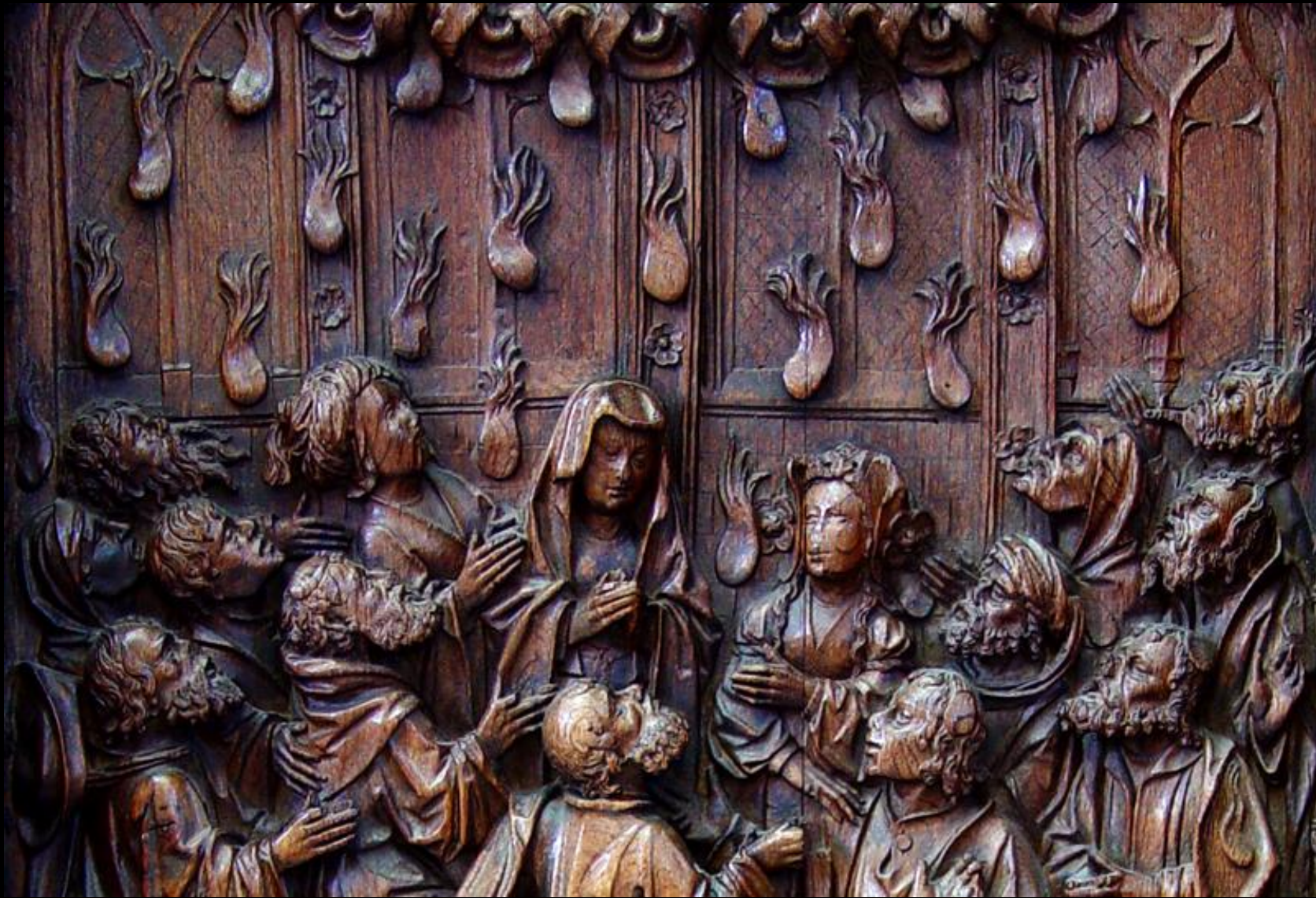
Pentecost -- Early 16 th century Choirstall, Amiens Cathedral, Amiens, France