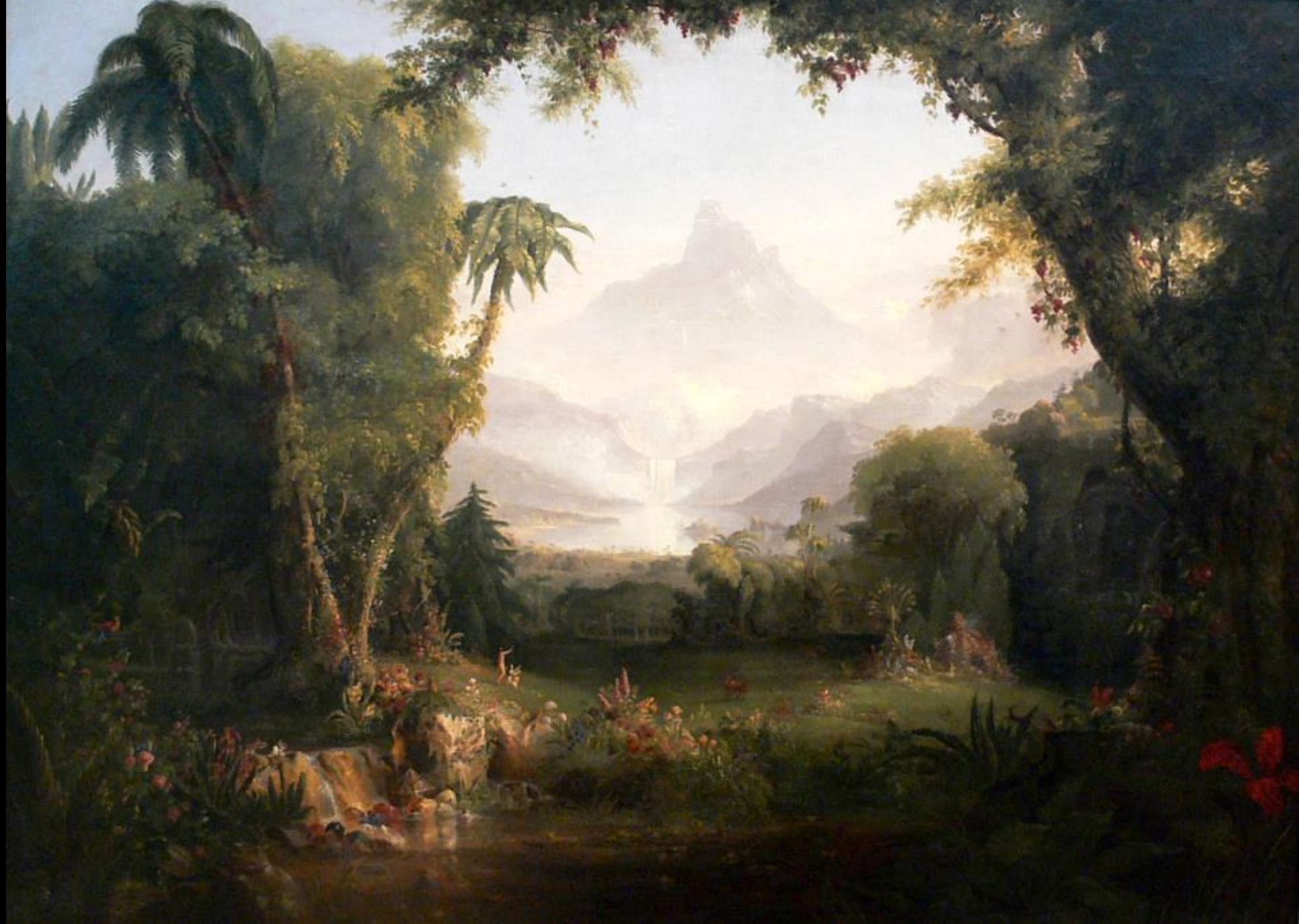
Garden of Eden -- Thomas Cole, Amon Carter Museum of Art, Fort Worth, TX