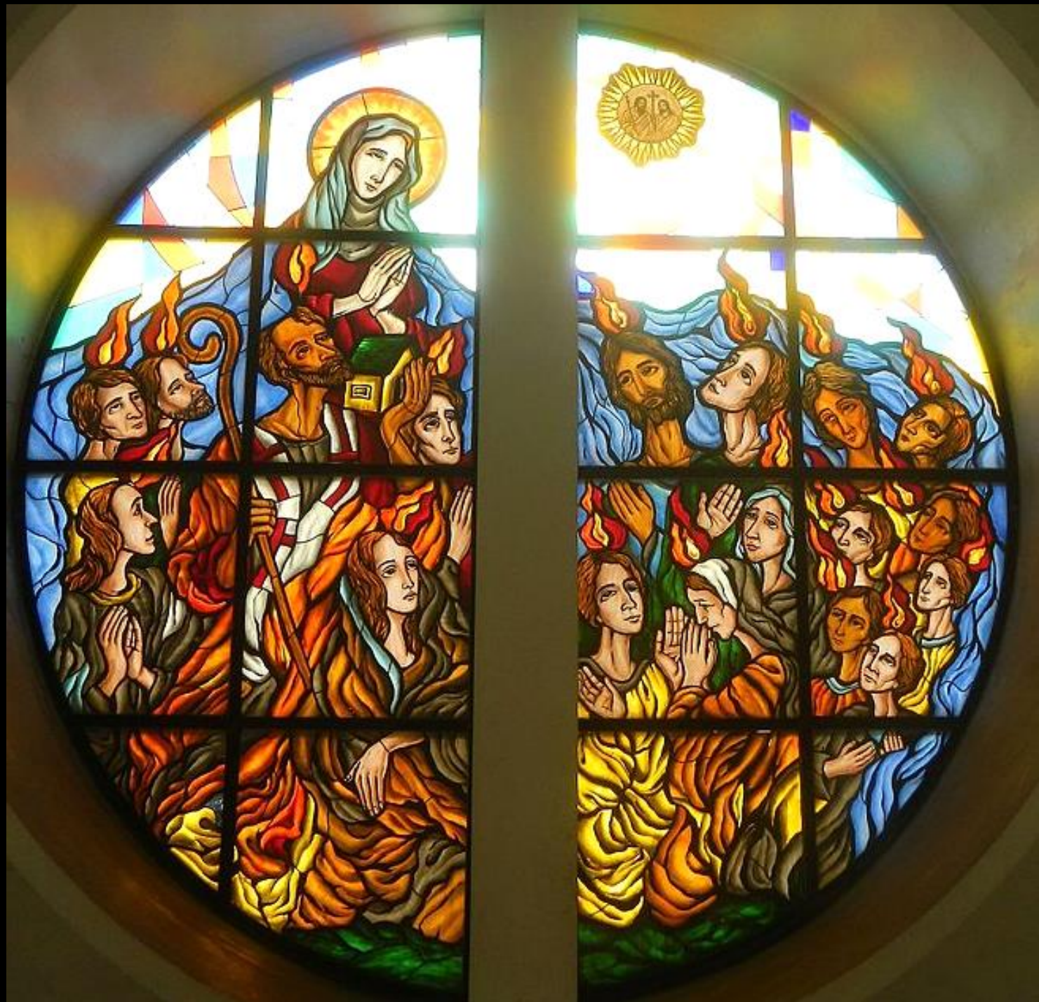
Pentecost Our Lady of Pentecost Catholic Church Quezon City, Philippines