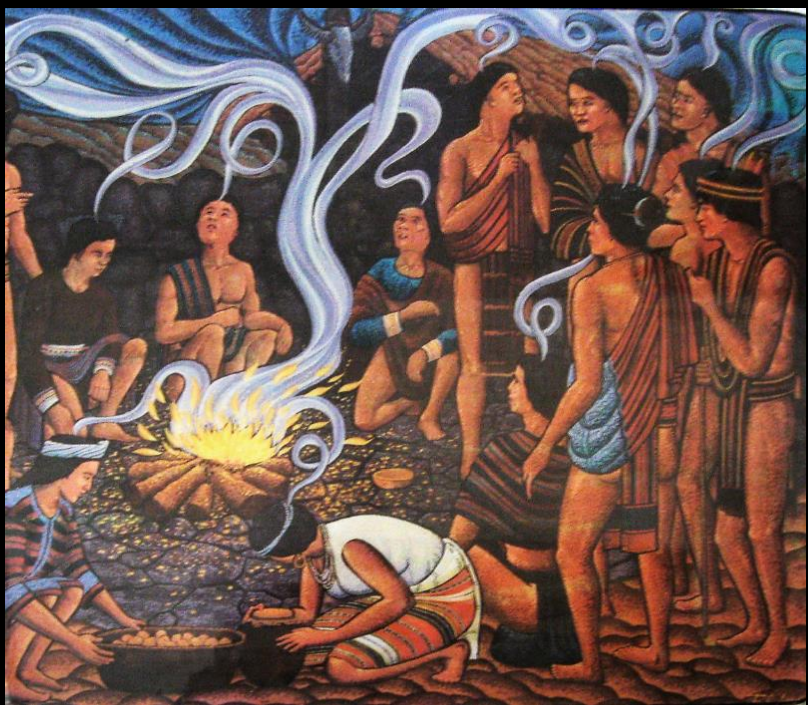
Pentecost Bontoc Museum Bontoc, Philippines