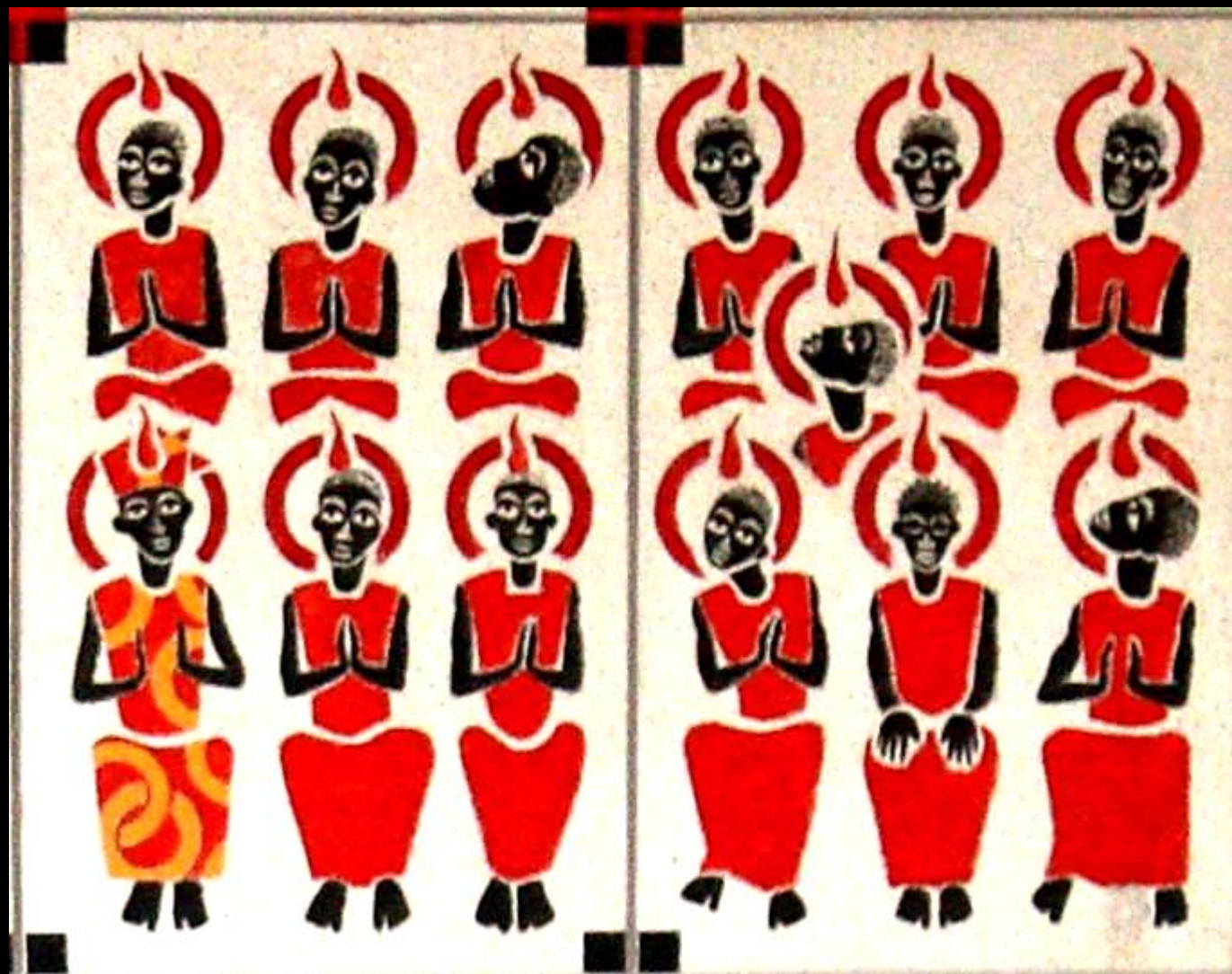
Pentecost -- Keur Moussa Abbey, Keur Moussa, Senegal