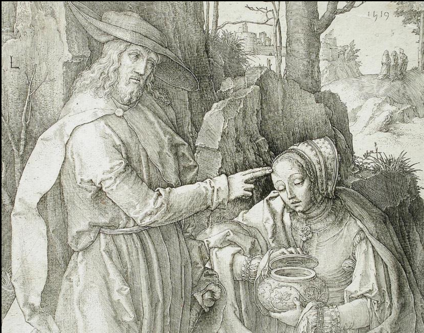
Christ Appears to Mary in the Garden -- Lucas van Leyden, Los Angeles County Museum of Art, CA