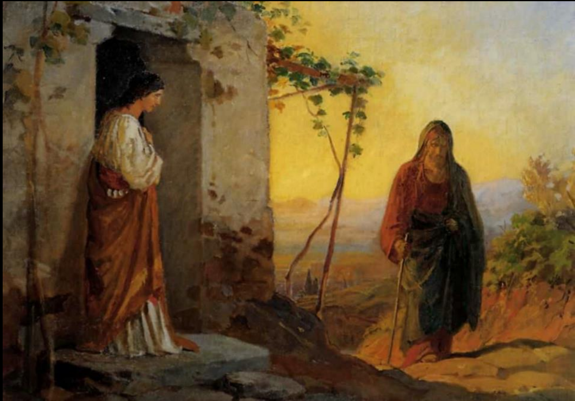
Mary, Sister of Lazarus, Greet Jesus -- Nikolai Ge, Russian, 1864