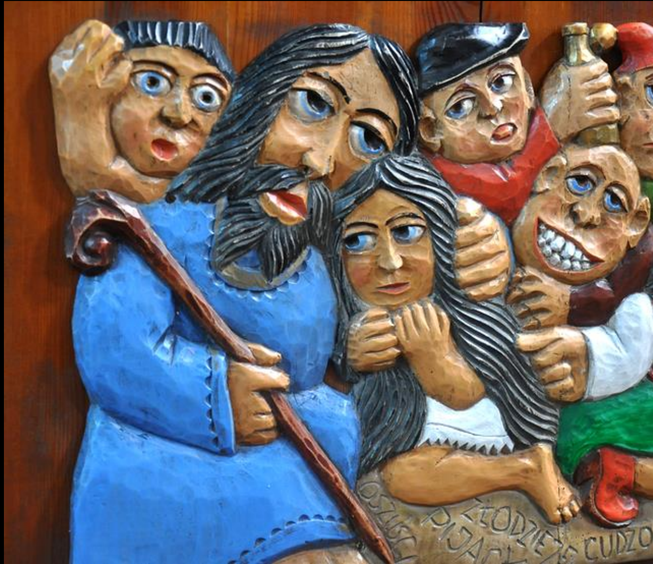
Mary of Bethany and Jesus -- Woodcarving, Paszyn, Poland