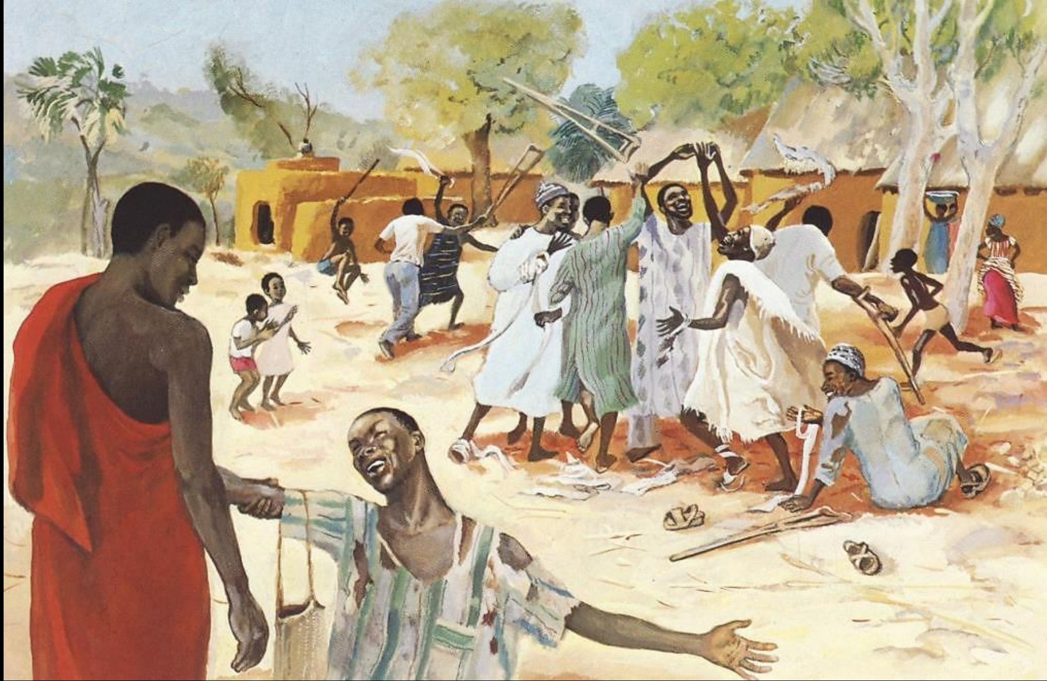
Healing of the Ten Lepers -- JESUS MAFA, Cameroon