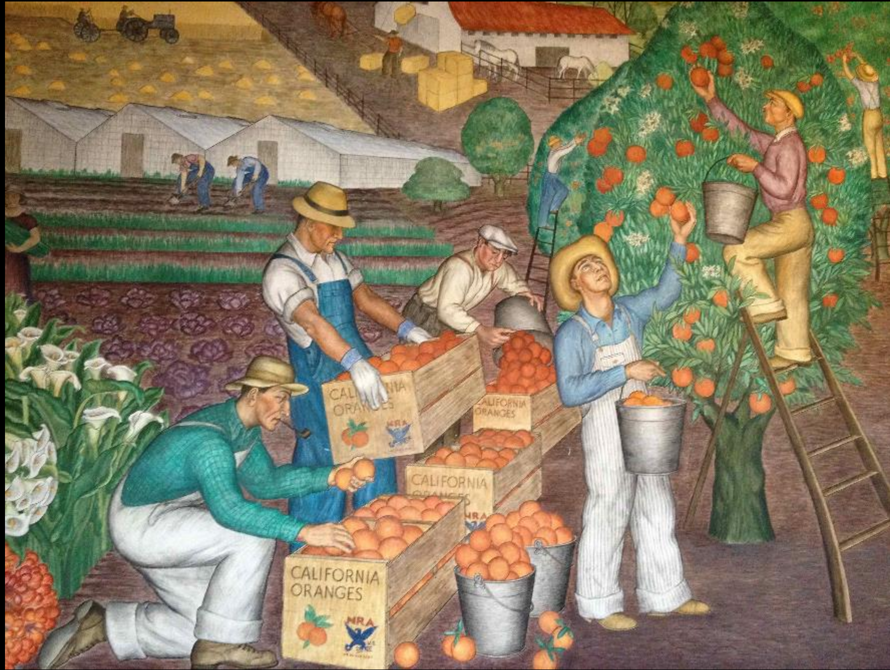
Migrant Farm Workers -- Mural, Coit Tower, San Francisco, CA