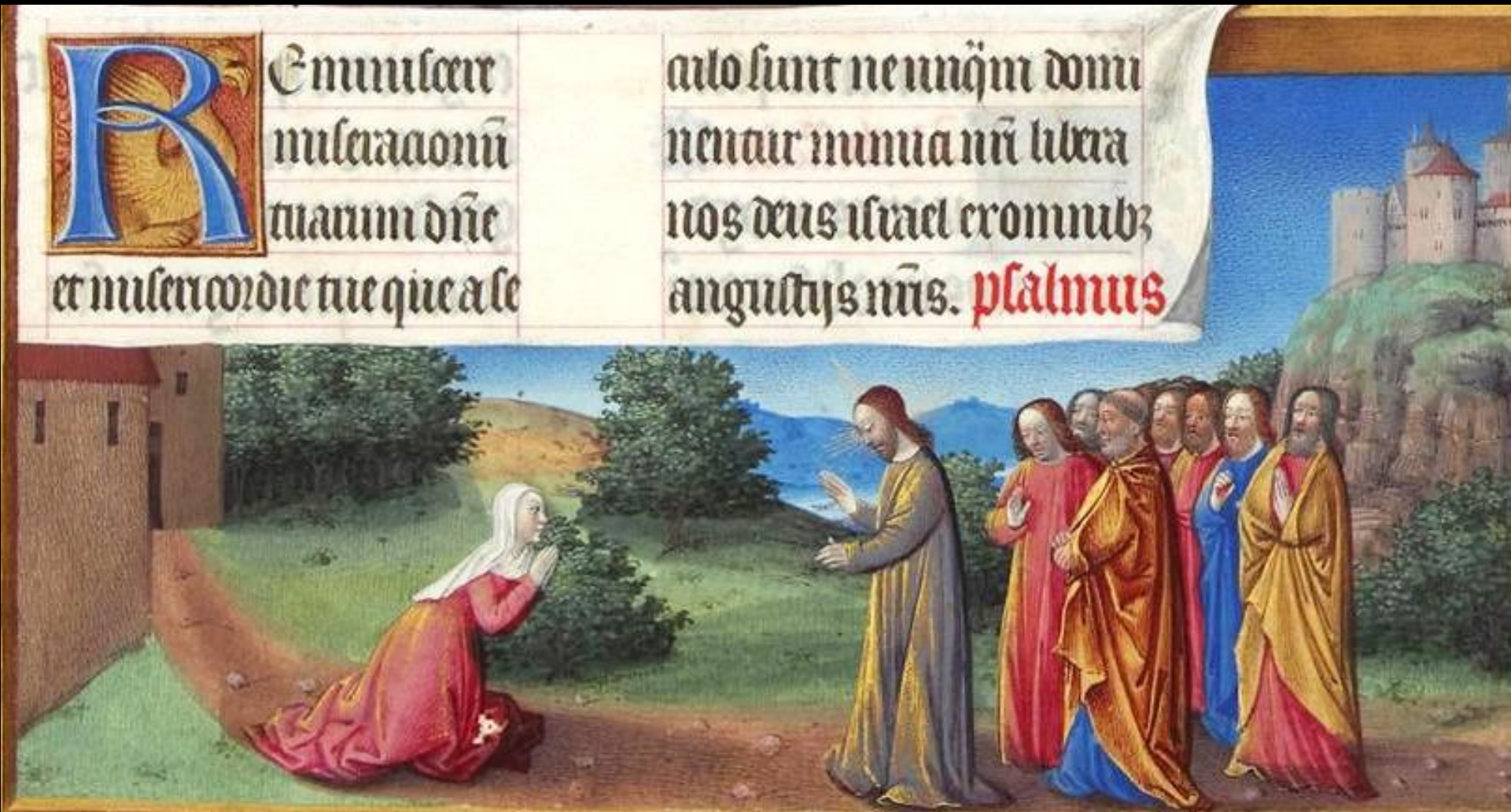
The Canaanite Woman -- Tres Riches Heures du duc de Berry, Musée Condé, Chantilly, France